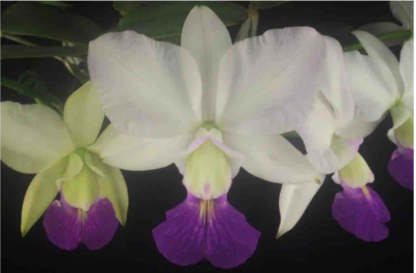
Cattleya walkeriana 'Isabel Rosalia' AM/AOS, exhibited by Orchid Eros