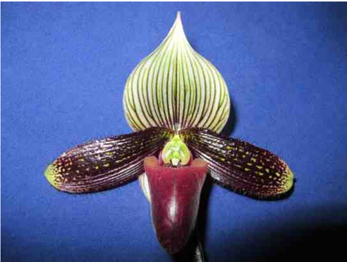
Right: Paph. spicerianum 'Lehua's Green Glow' AM/AOS, exhibited by Lehua Orchids