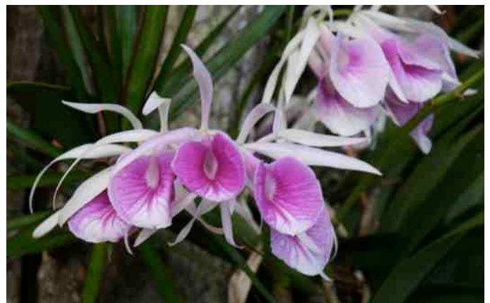
Bl. Morning Glory, a hybrid cross of two species.