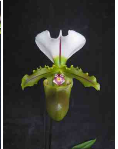
Left: Paph. (Acclamation x Gridlock) 'Little Jaguar' AM/AOS, exhibited by Hilo Orchid Farm