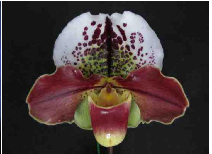
Left: Paph. (Petula's Song x Love Song) 'Lehua's Contrasting Glow' HCC/AOS, exhibited by Lehua Orchids