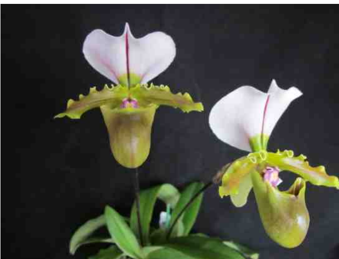
Right: Paph. Hilo Spotter 'New Star' AM/AOS, exhibited by Hilo Orchid Farm