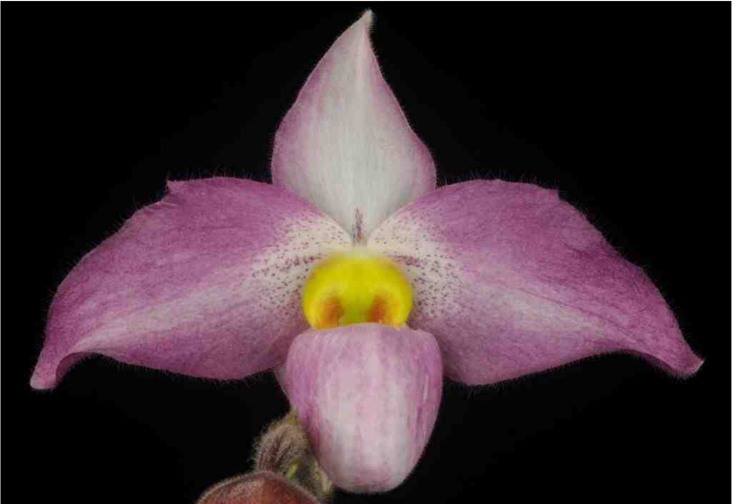
Paphiopedilum Saigon Pink 'Lehua's Pink Phantom' AM/AOS, grown by Lehua Orchids