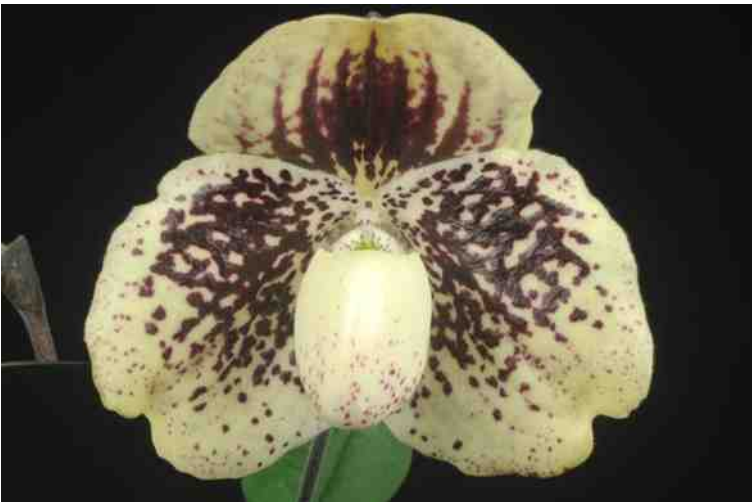
Left: Paph. godefroyae 'Gold Fish' HCC/AOS, grown by Hilo Orchid Farm