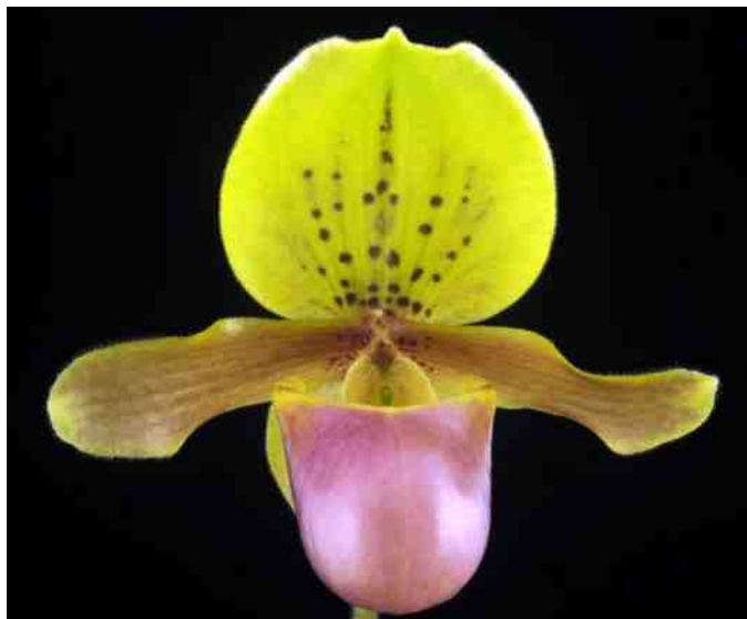
Left: Lc. Flamingo Dance 'Orchid Eros' AM/AOS, grown by Orchid Eros Right: Paph. Wossner Ministar 'Lisa' HCC/AOS, grown by Alawaena Orchids