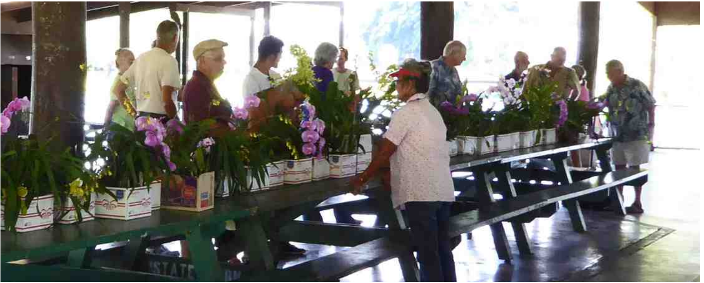
The silent auction table was filled with beautiful plants donated by our orchid show vendors.