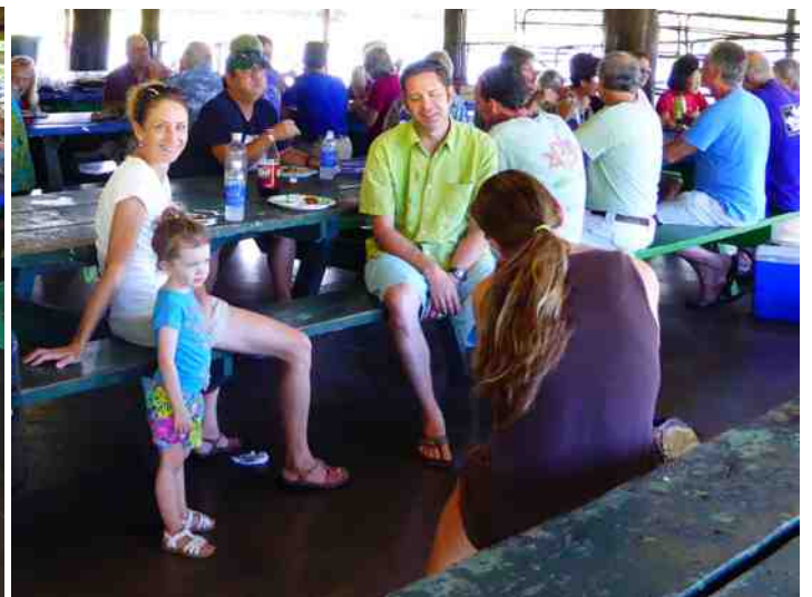
There was tons of delicious food. Everyone had a good time.