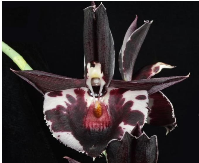
Left: Cattleya alaorii h.,f. semi-alba 'Pucker Up' AM/AOS, grown by Orchid Eros Right: Catasetum Dreamboat 'Shogun's Dive into the Abyss #2' AM/AOS, grown by Shogun Hawaii