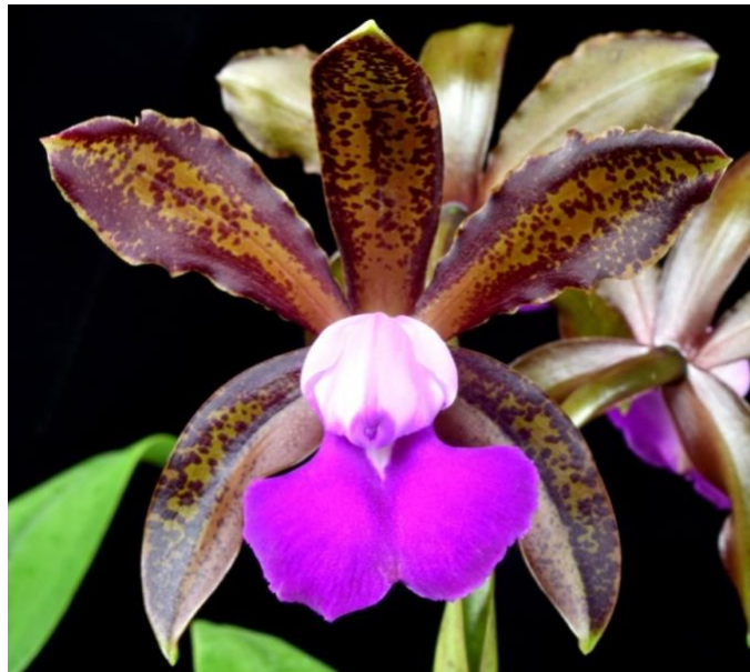
Left: Cattleya Trufords Cat 'Orchid Eros' AM/AOS, grown by Orchid Eros Right: Cattleya Trufords Cat 'Sebastian Ferrell' AM/AOS, grown by Orchid Eros