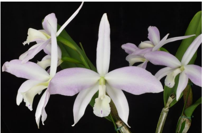
Right: Cattleya perrinii 'Ave Maria' HCC/AOS, grown by Orchid Eros