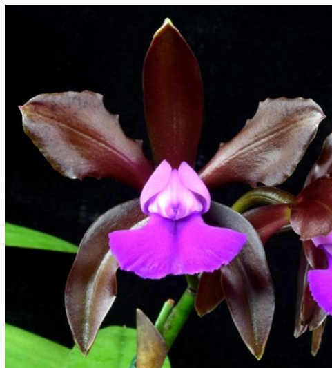
Left: Cattleya praestans 'Doppelganger' AM/AOS, grown by Orchid Eros Right: Cattleya Trufords Cat 'Gabriel Amaru' AM/AOS, grown by Orchid Eros