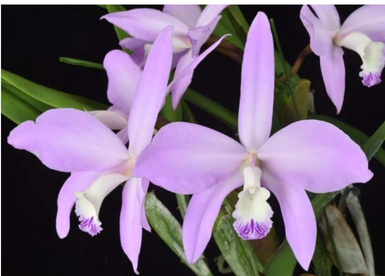
Right: Cattleya perrinii 'Pastoral Symphony' AM/AOS, grown by Orchid Eros