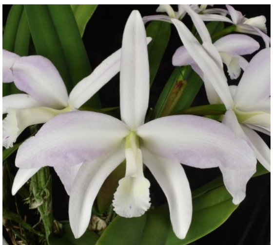
Left: Cattleya perrinii 'Dance of the Hours' AM/AOS, grown by Orchid Eros