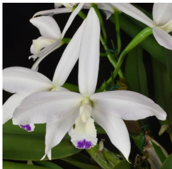
Left: Cattleya perrinii 'Pretty In Pink' AM/AOS, grown by Orchid Eros