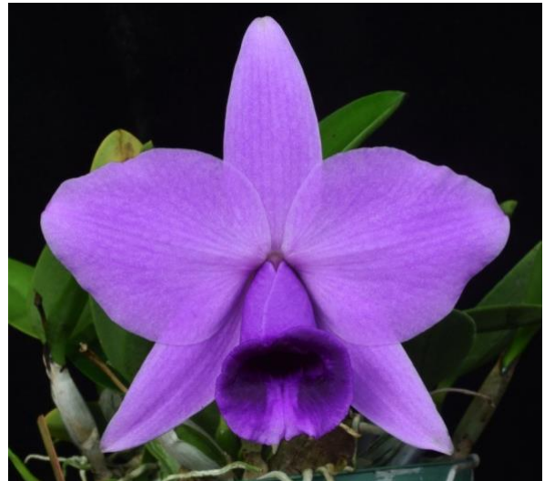
Left: Cattleya perrinii h.f. delicata 'Sebastian Ferrell' FCC/AOS, grown by Orchid Eros Right: Cattleya praestans 'Copy Catt' AM/AOS, grown by Orchid Eros