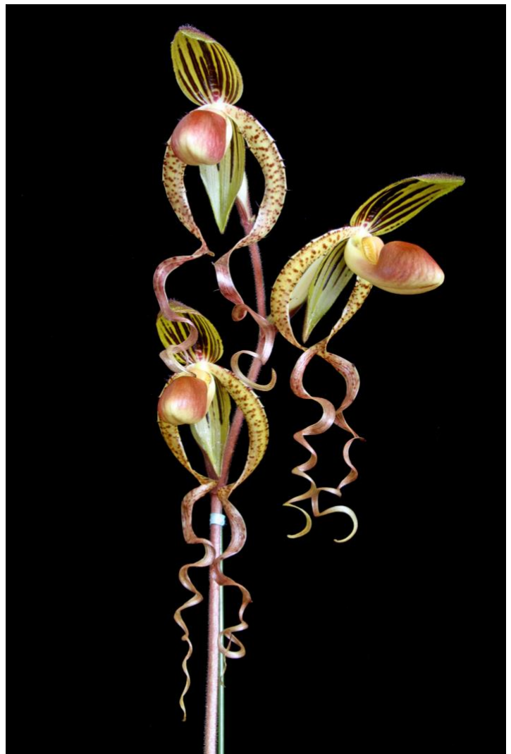
Paph. Chiu Hua Dancer

Then again, some people like paphs because they aren’t “pretty”. After all, much of the beauty of a Cattleya is in its exotic, irregular form compared to, say, a daisy. Paph. Chiu Hua Dancer couldn’t be more dramatic (see photo). It inherits its curly petals from its parent Paph. sanderianum . Much modern hybridizing has utilized such dramatic species and gotten away from the traditional round flowers.