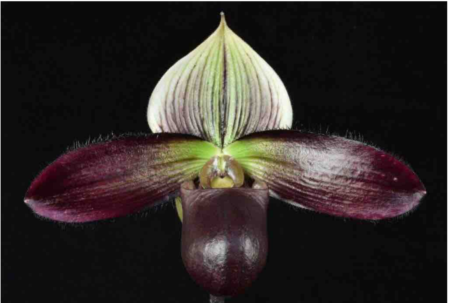
Paph. Hawaiian Illusion 'Slipper Zone Red Beckons' HCC/AOS, grown by Lehua Orchids