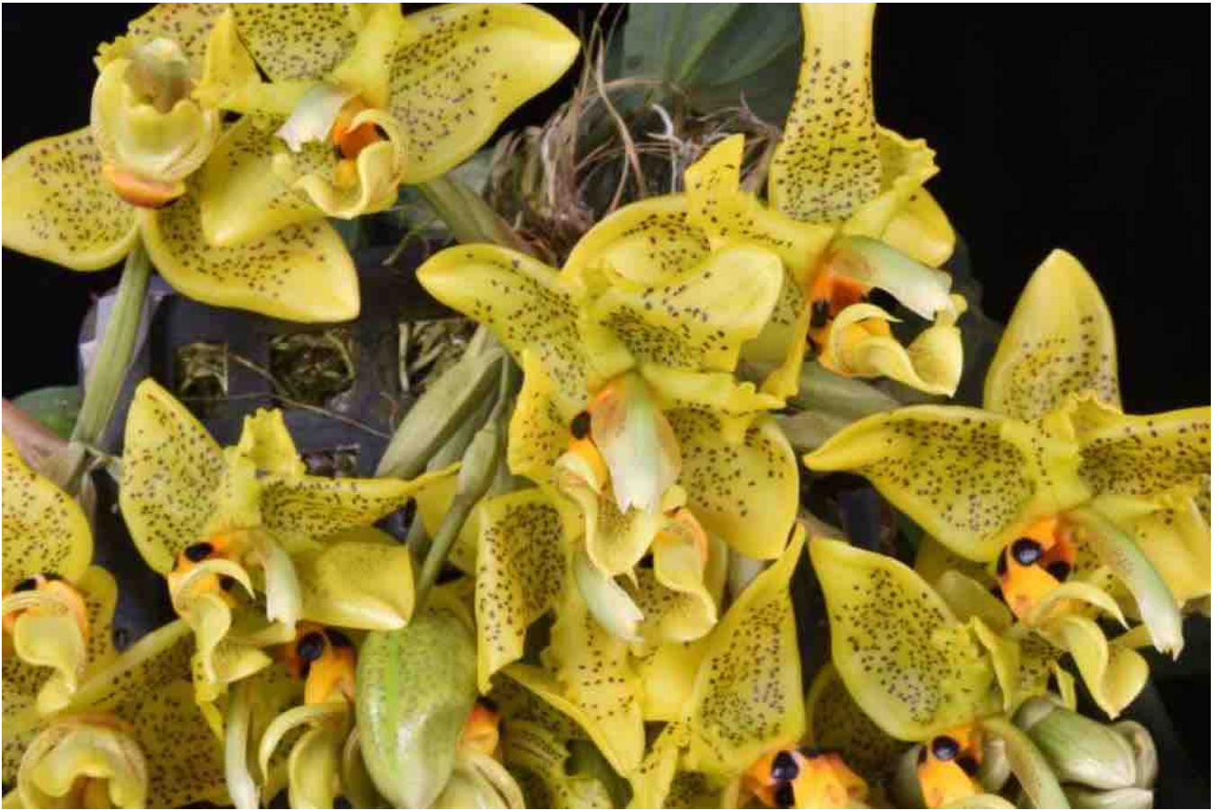
Stanhopea wardii 'Mauna Loa' HCC/AOS, grown by Okika.