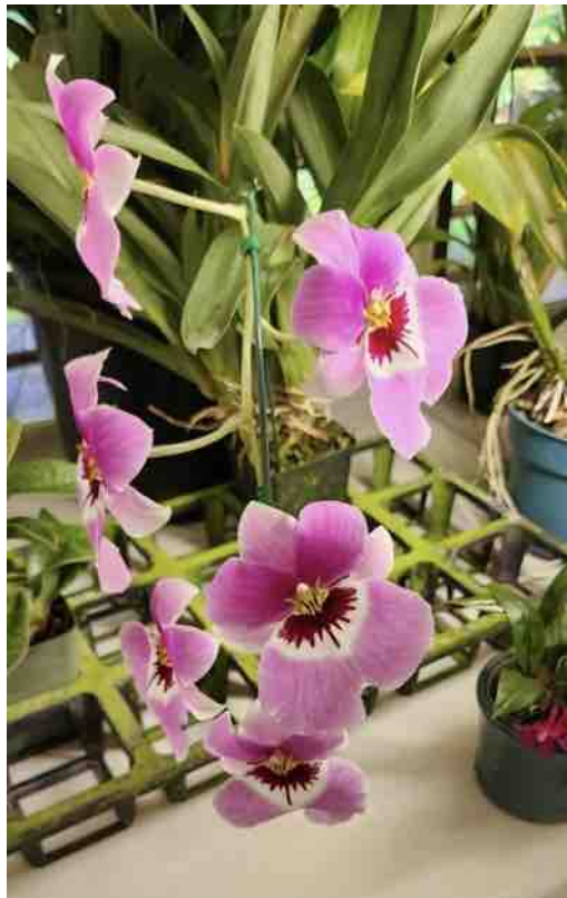
Left: Miltonia moreliana Center: No-name Miltoniopsis Right: Vanda nicknamed "Purple people eater"