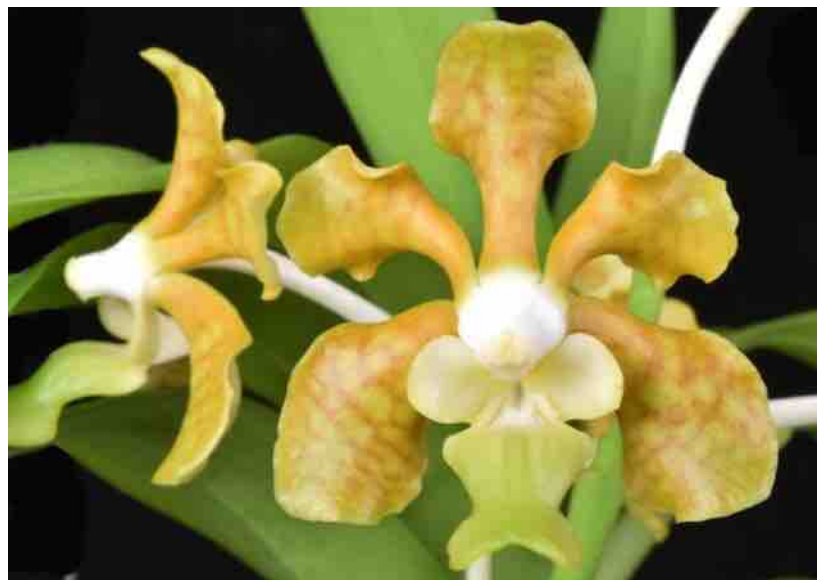
Left: Paph. gratrixianum h.v. daoense 'Slipper Zone Perner Pops' AM/AOS, grown by Lehua Orchids Right: Vanda brunnea 'Lusciously Lemony' AM/AOS, grown by Island Sun Orchids