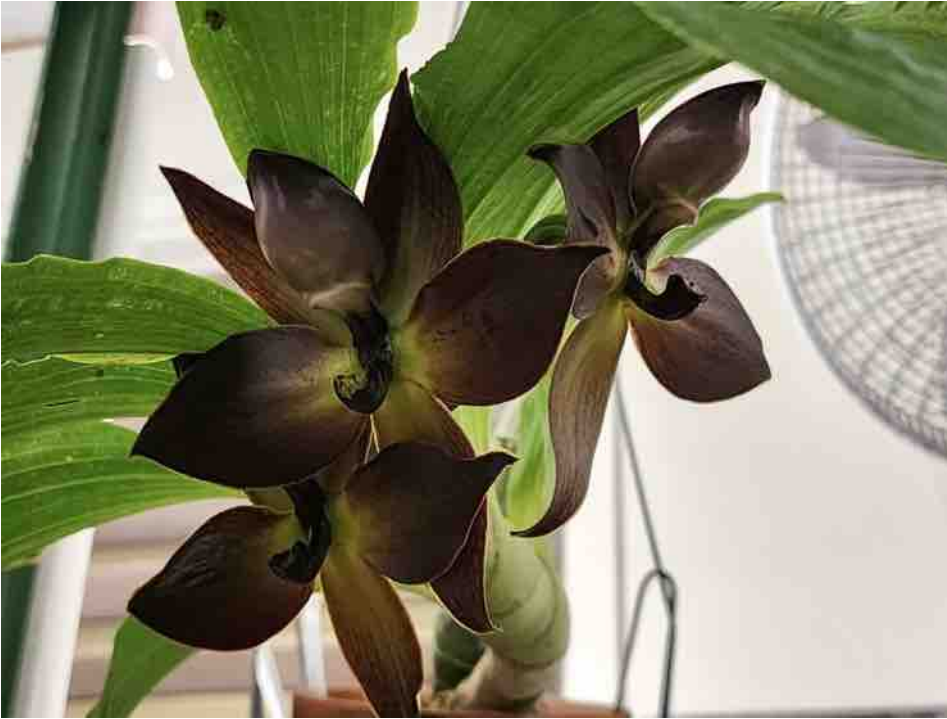
Left: Cycnoches Jumbo Cooper (female flowers) Right: Dendrochilum glumaceum