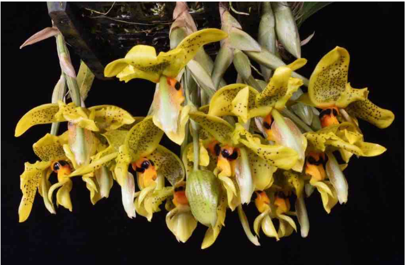
Another view of Stanhopea wardii 'Mauna Loa' HCC/AOS, grown by Okika.