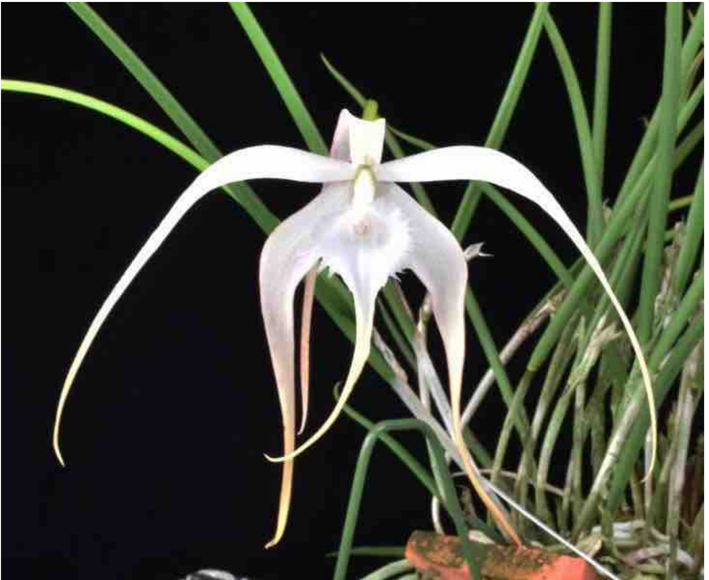
Brassavola cucullata 'Trinidad' CHM/AOS, grown by Orchid Eros (true cucullata , not appendiculata )