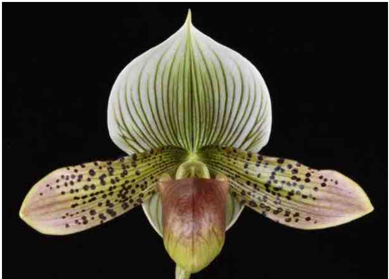
Right: Paphiopedilum Pleasure in Pink 'Slipper Zone Eleven Others' HCC/AOS, grown by Lehua Orchids