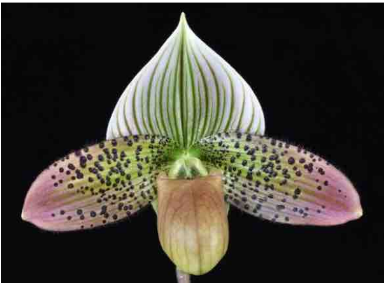
Left: Paphiopedilum Petula's Wood 'OrchidFix Happy Christmas' AM/AOS, grown by OrchidFix