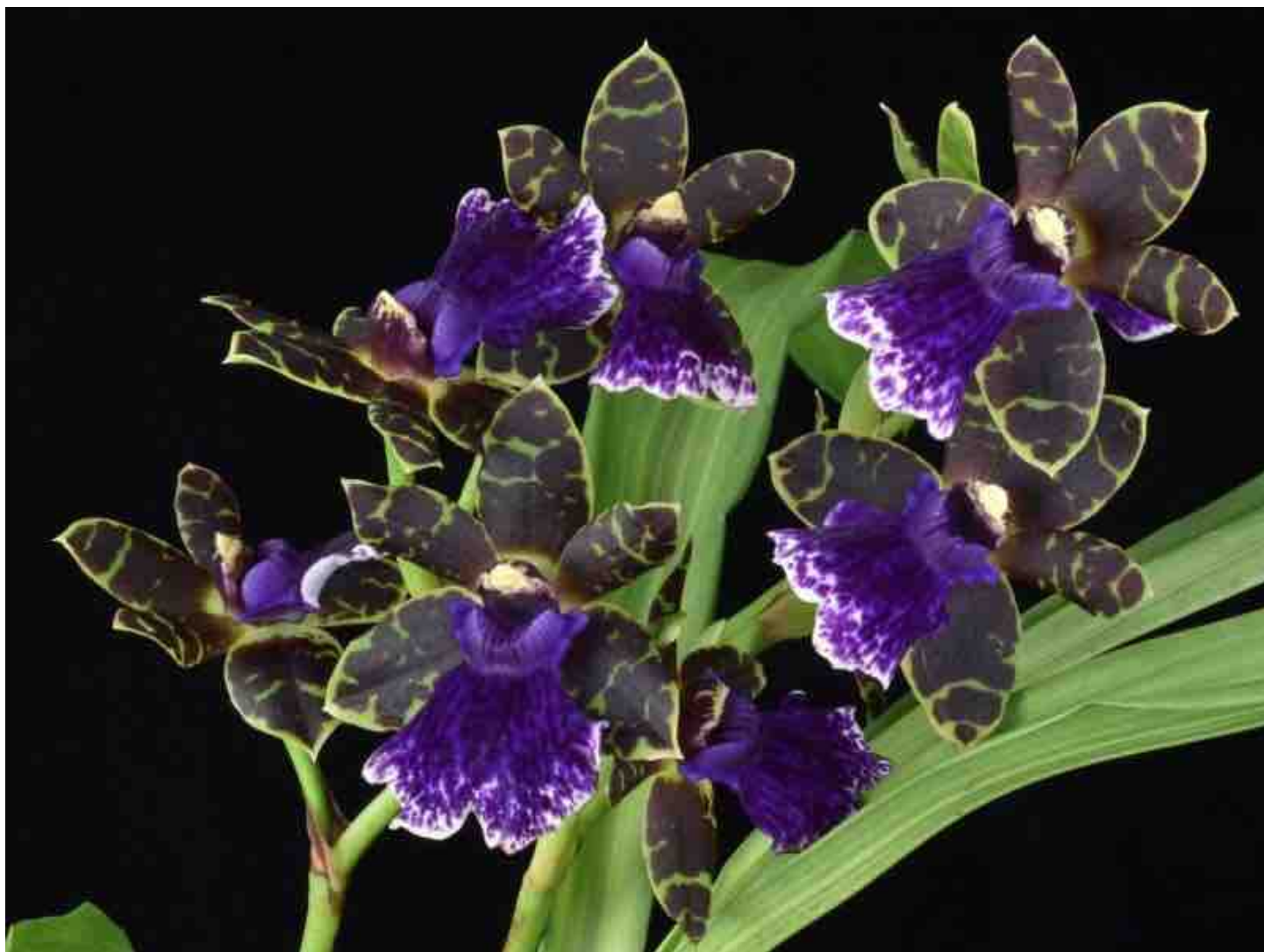
Zygopabstia Woodlandsense 'Blue Bird' AM/AOS, grown by Kalapana Tropicals