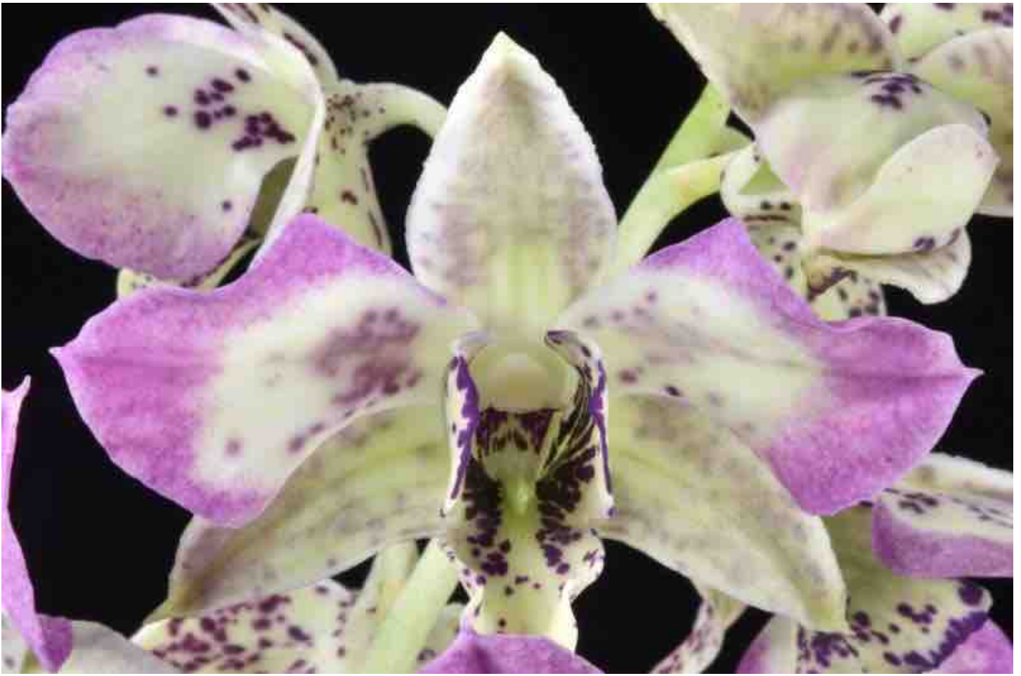
Dendrobium Roy Tokunaga 'OrchidFix Poetry in Pink' AM/AOS, grown by OrchidFix