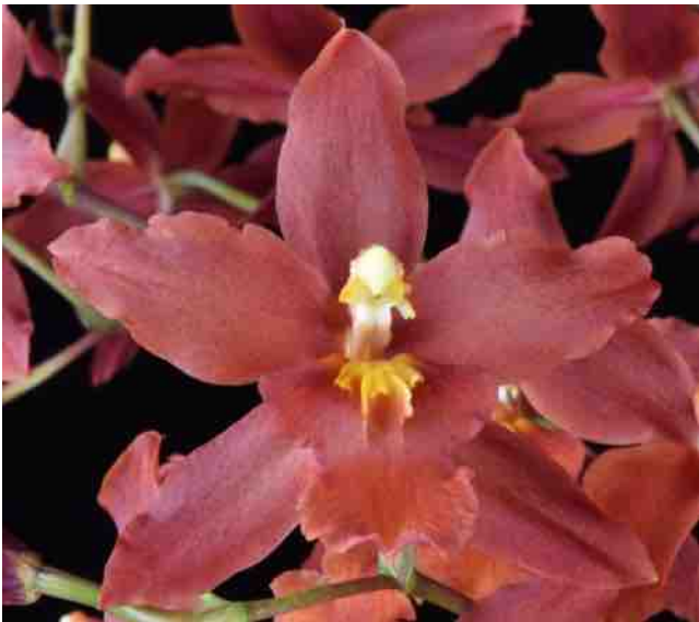
Left: Oncidium Space Mine 'Red Rendezvous' AM/AOS, grown by Kalapana Tropicals