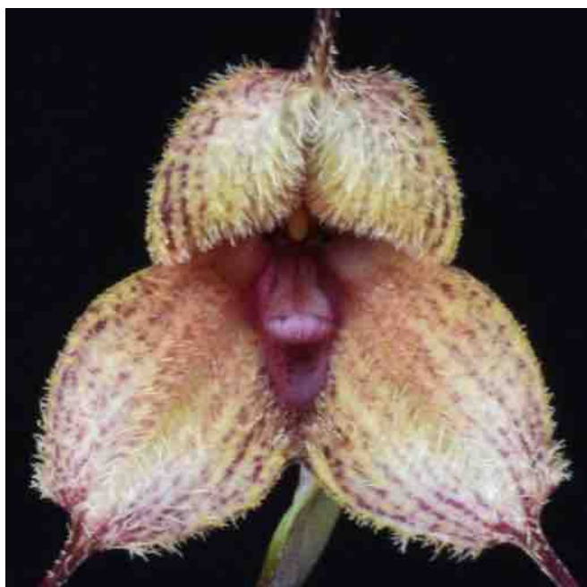
Left: Dracula kareniae 'Pink Pleasure' AM/AOS, grown by Jungle Mist Orchids