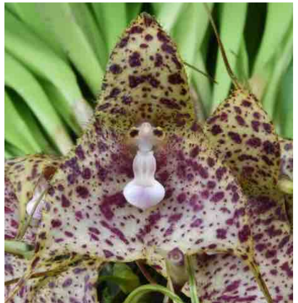
Left: Dendrobium QF Akala 'QF Marissa' AM/AOS, grown by Quintal Farms Right: Dracula vespertilio 'Demigorgon' AM/AOS, grown by Jungle Mist Orchids