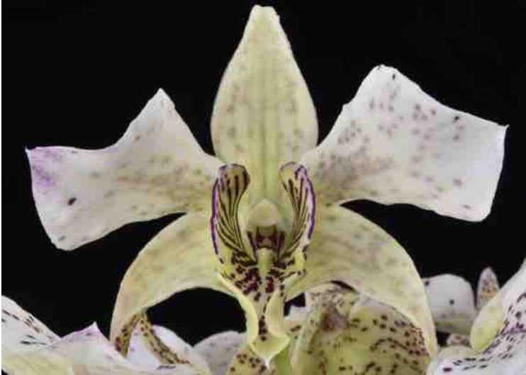
Left: Dendrobium QF Akala 'QF Aurea' AM/AOS, grown by Quintal Farms