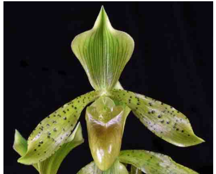
Right: Paphiopedilum tonsum h.f. curtisifolium 'AM/AOS, grown by Quintal Farms