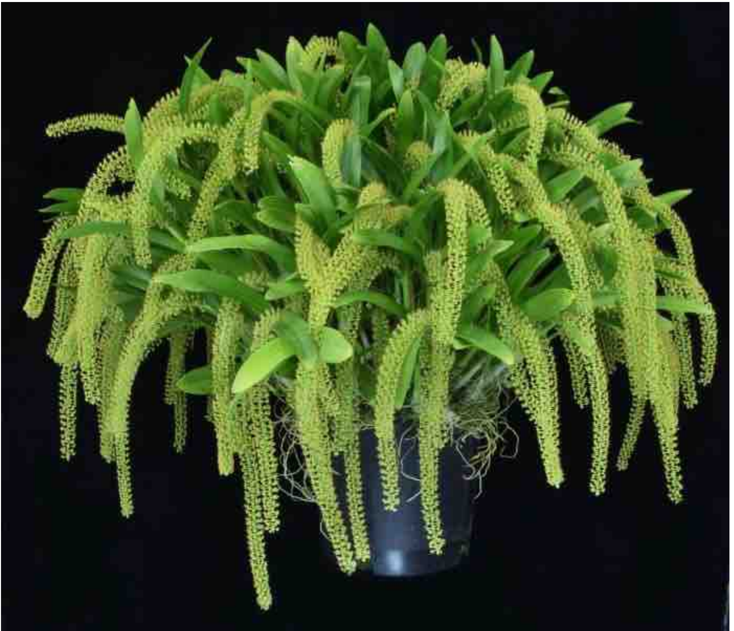
Liparis viridiflora 'Totally Tubular' CCE/AOS, grown by Jungle Mist Orchids