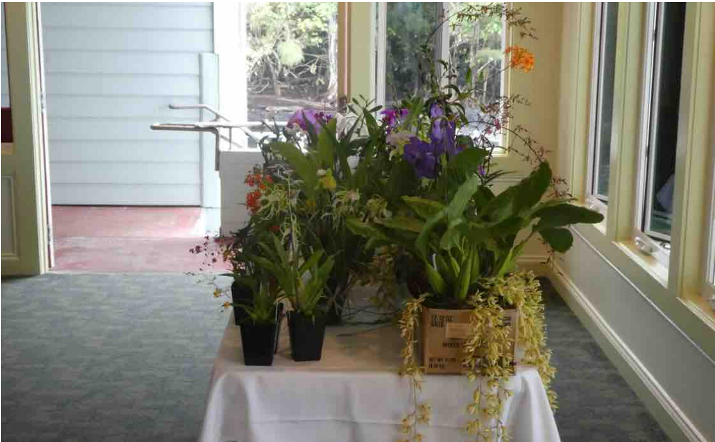
Some of the orchids that were auctioned off at the Holiday Party.