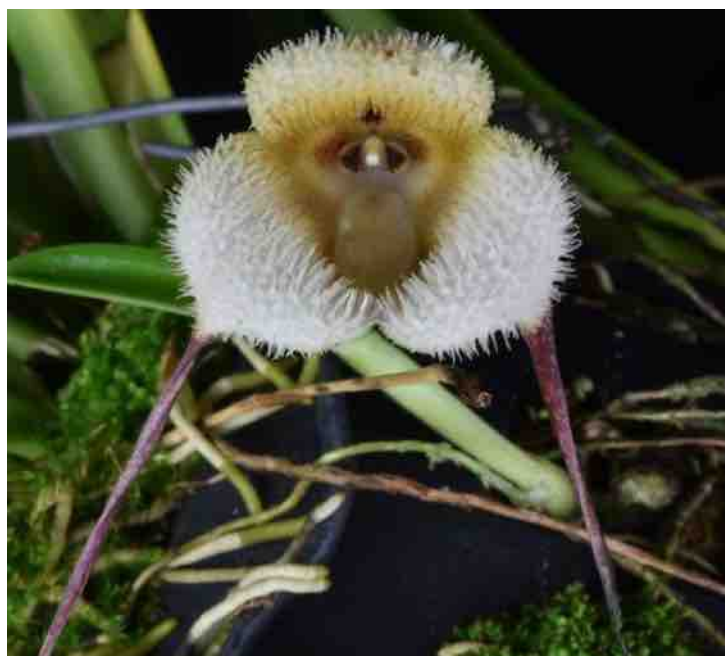
Right: Drac. saulii 'Spider Monkey' CHM/AOS, grown by Jungle Mist Orchids