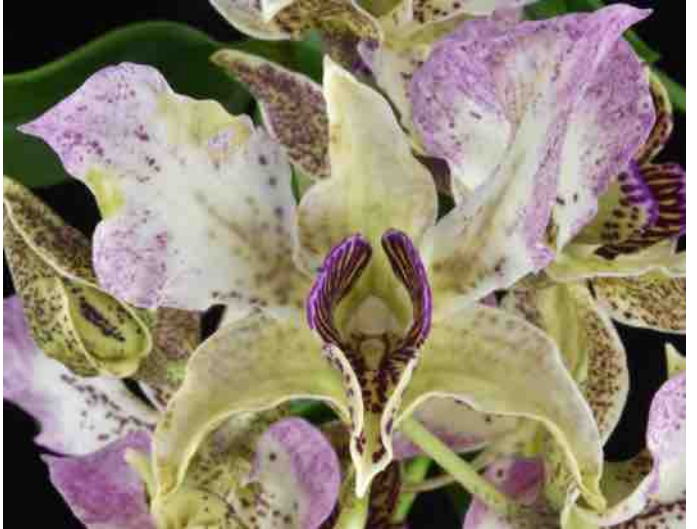
Right: Dendrobium QF Akala 'QF Kaila' AM/AOS, grown by Quintal Farms