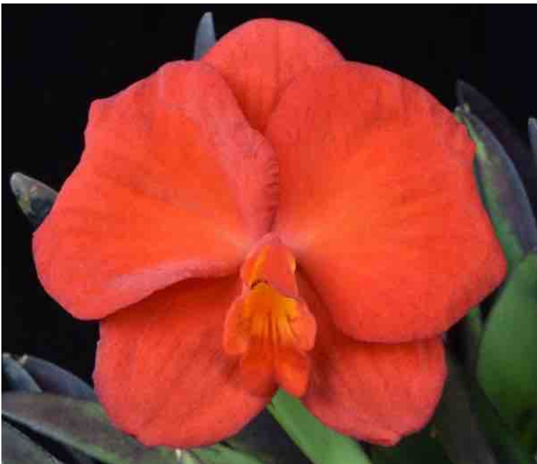
Left: Cattleya coccinea 'Okika' AM/AOS, grown by Okika