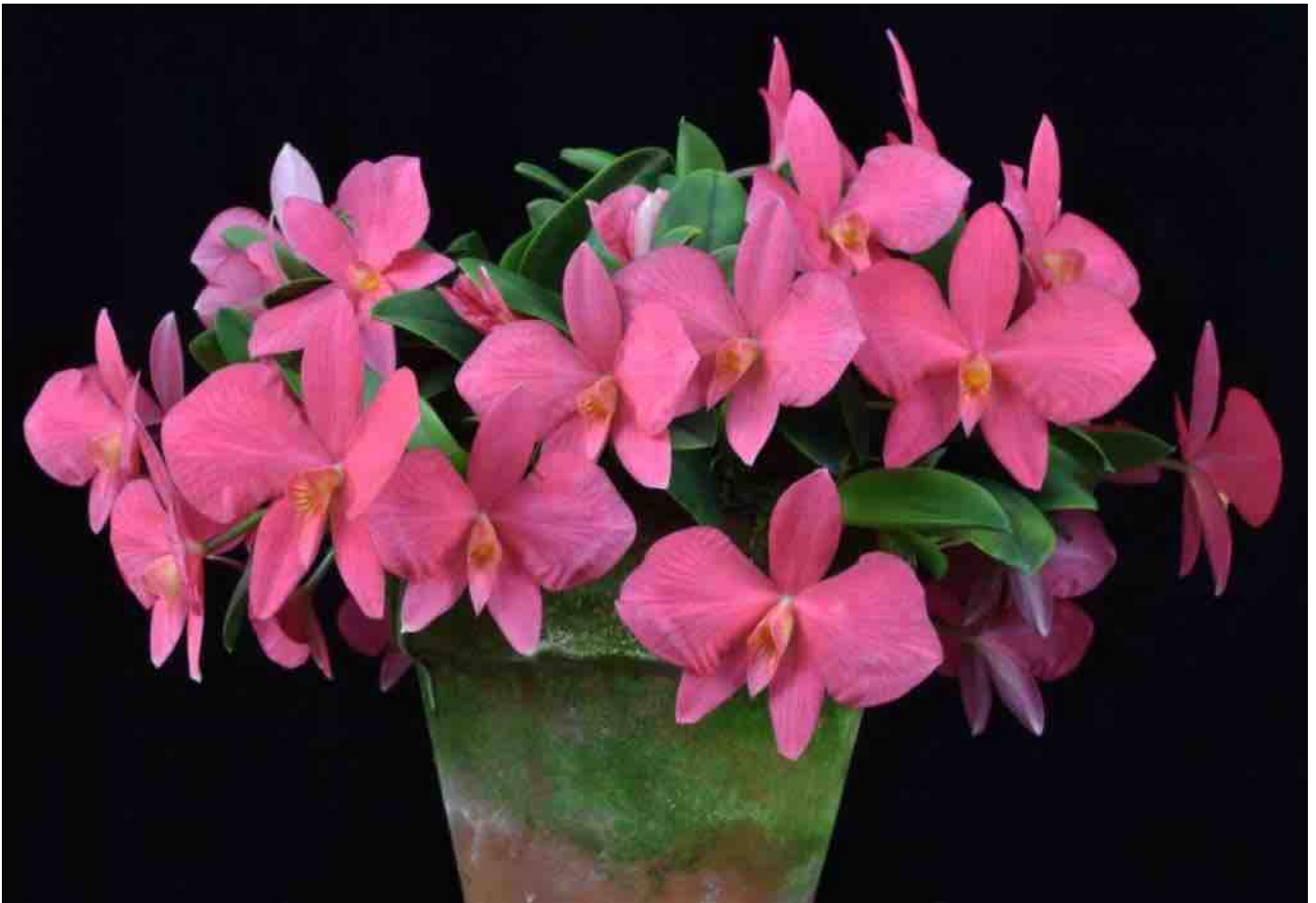
Cattleya brevipedunculata 'Sebastian Ferrell' AM/AOS, CCE/AOS, grown by Orchid Eros