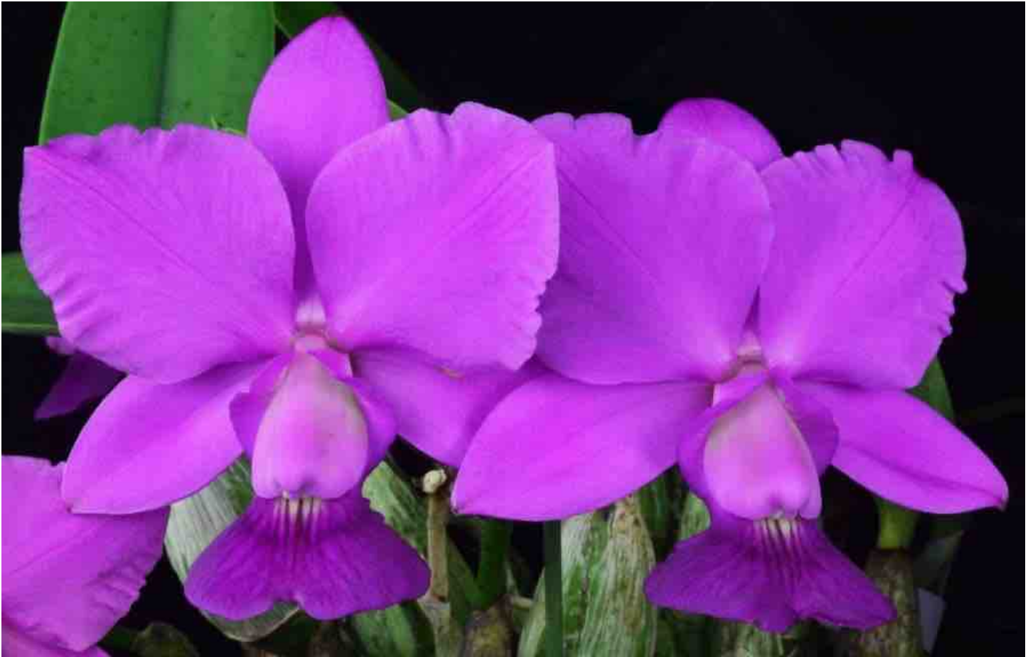
Cattleya walkeriana 'Venda Nova' AM/AOS, grown by Orchid Eros