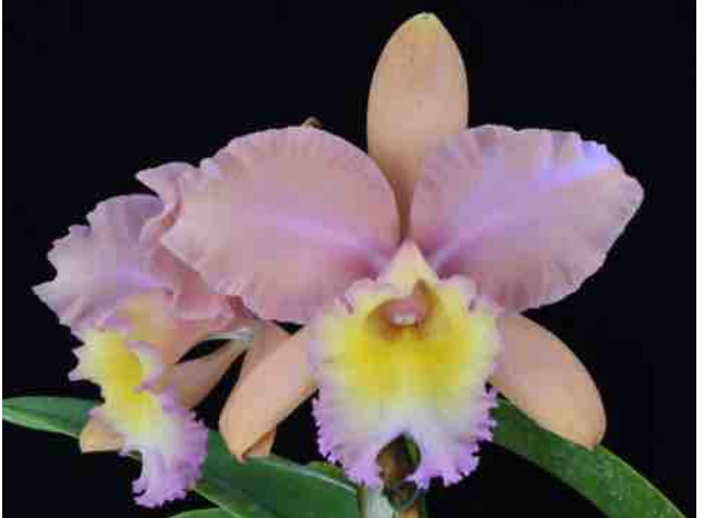
Right: Rlc. Princess of Hawaii 'Pastel Queen' HCC/AOS, grown by Shogun Hawaii