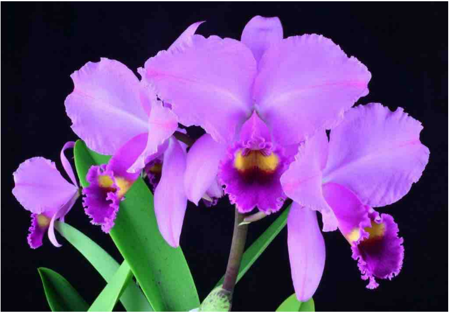
Cattleya trianae 'Mick Jagger' AM/AOS, grown by Orchid Eros