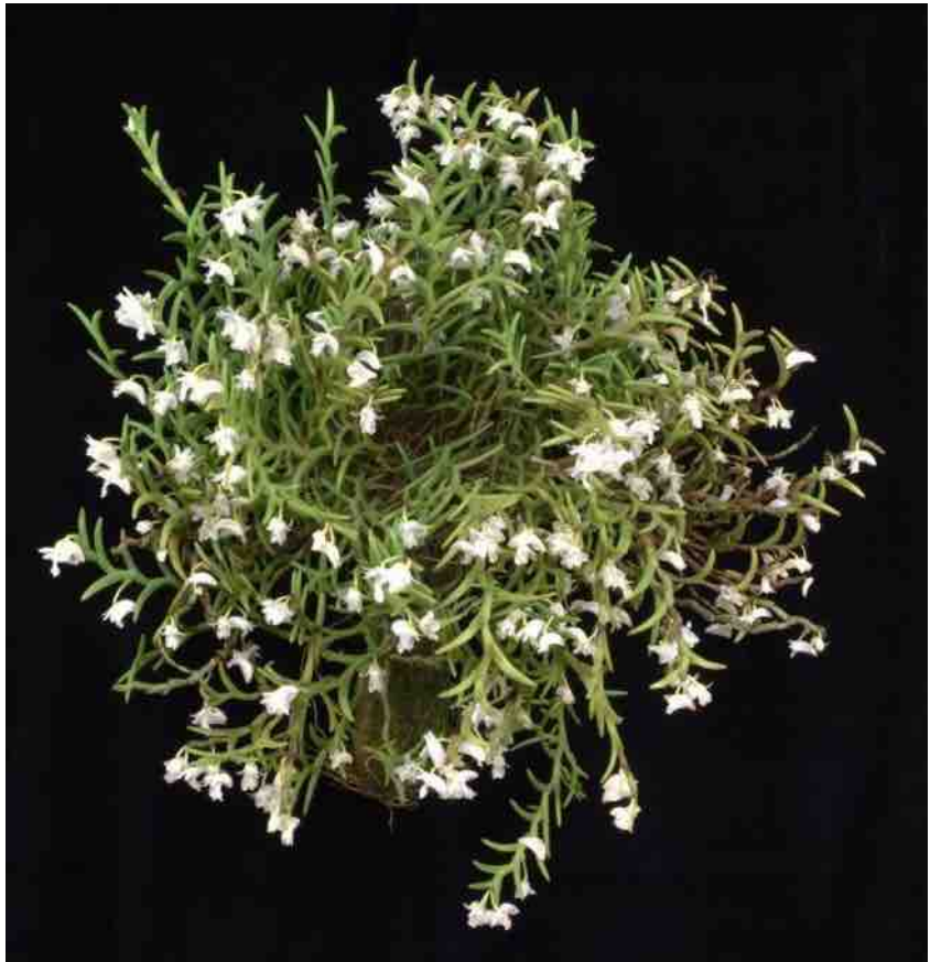
Right: Dendrobium kentrophyllum 'Pearl' CCE/AOS, grown by Island Sun Orchids