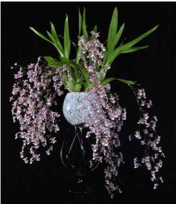
Left: Oncidium ornithorhynchum 'Okika' HCC/AOS, grown by Okika