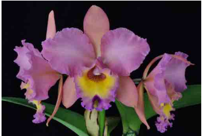
Right: Rlc. Princess of Hawaii 'Shogun's Summer Nights' AM/AOS, grown by Shogun Hawaii