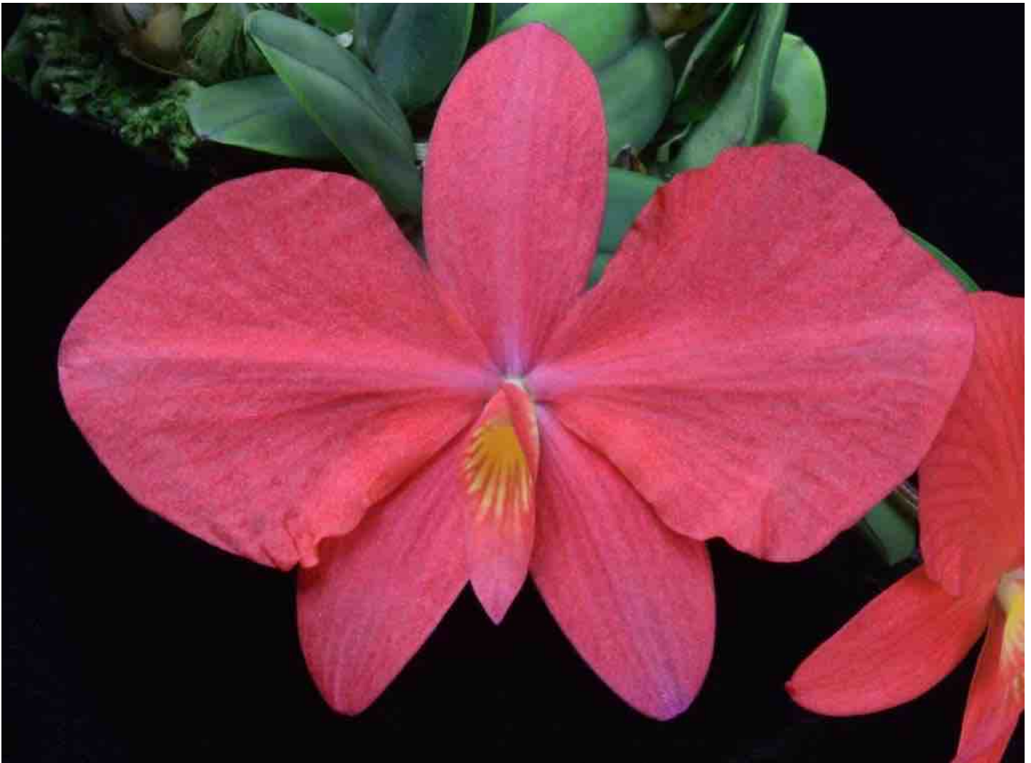
Cattleya brevipedulata 'Gabriel Amaru' FCC/AOS, grown by Orchid Eros