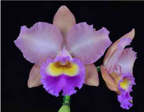
Left: Rlc. Princess of Hawaii 'Hawaiian Goddess' AM/AOS, grown by Shogun Hawaii