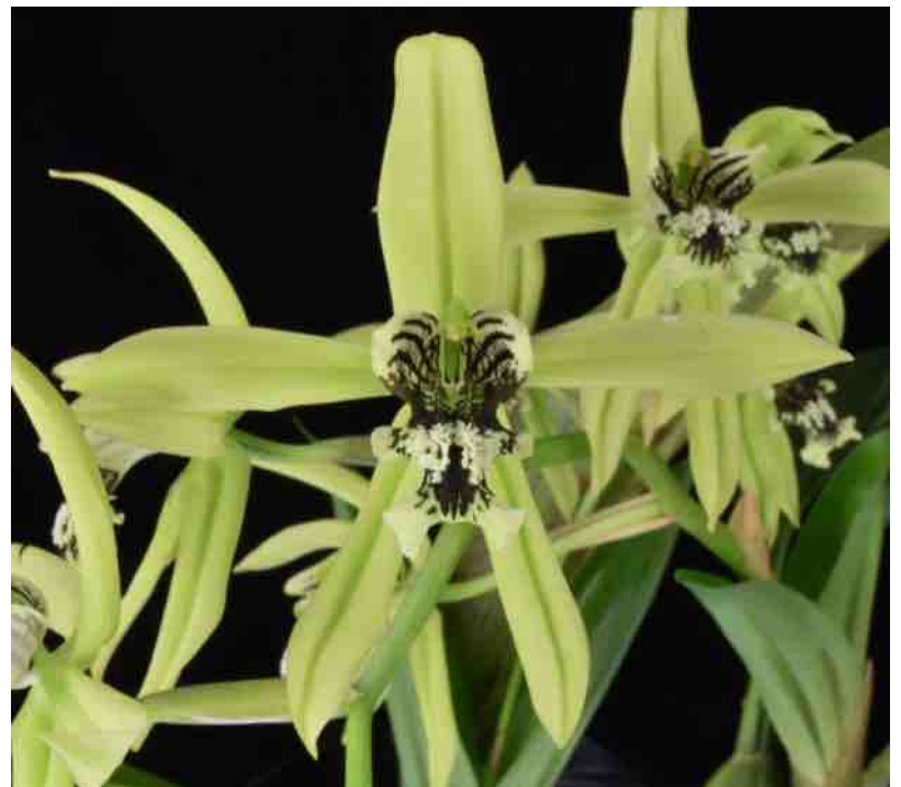
Left: Cochlezeella Tsiku Chuchango 'Mateo's Blue' AM/AOS, grown by Kalapana Tropicals Right: Coelogyne mayeriana 'Okika' AM/AOS, grown by Okika