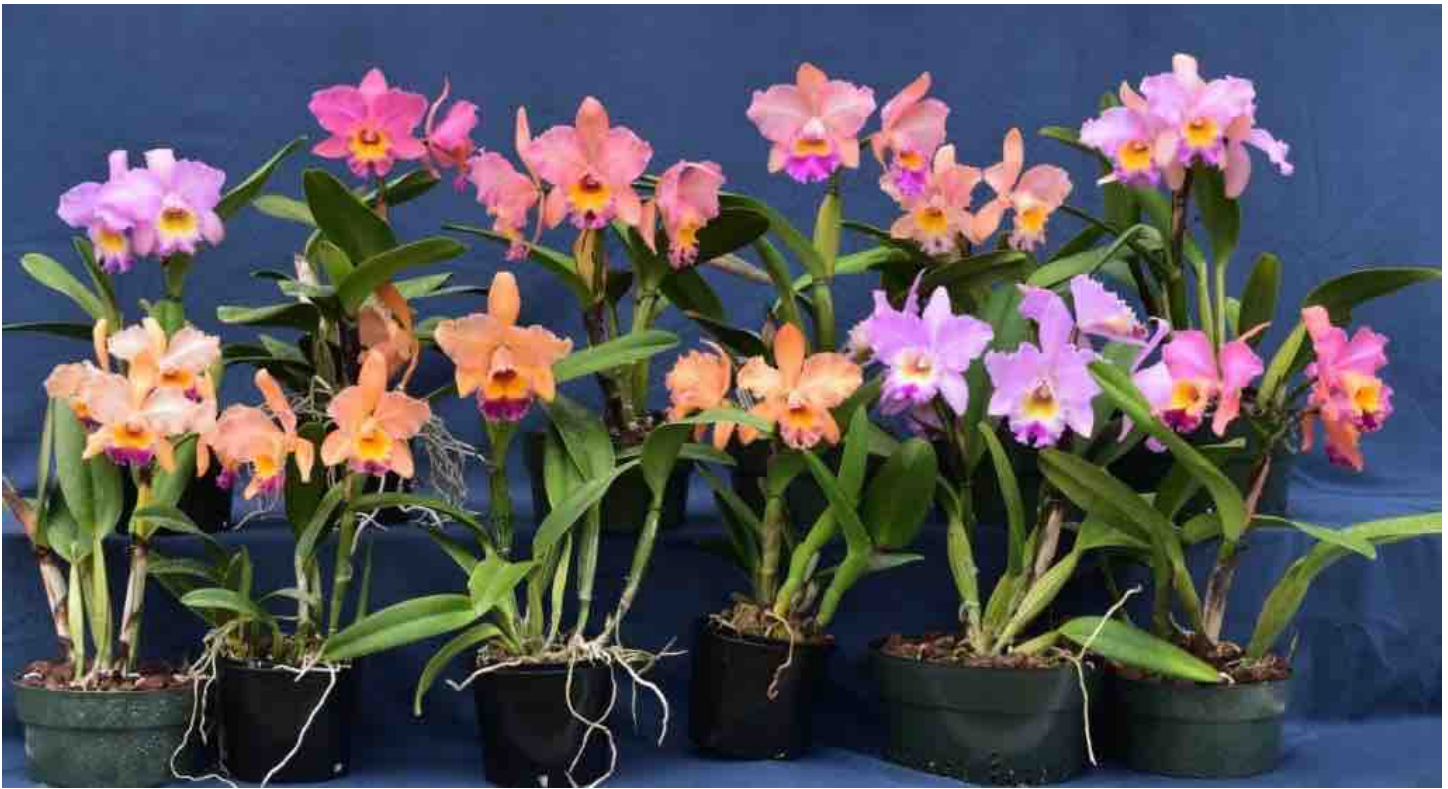
Rlc. Princess of Hawaii AQ/AOS, grown by Shogun Hawaii