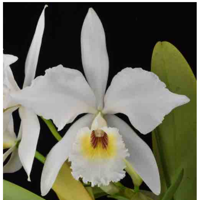
Right: Cattleya labiata h.f. semialba 'Shogun's Dream Catcher' AM/AOS, grown by Shogun Hawaii