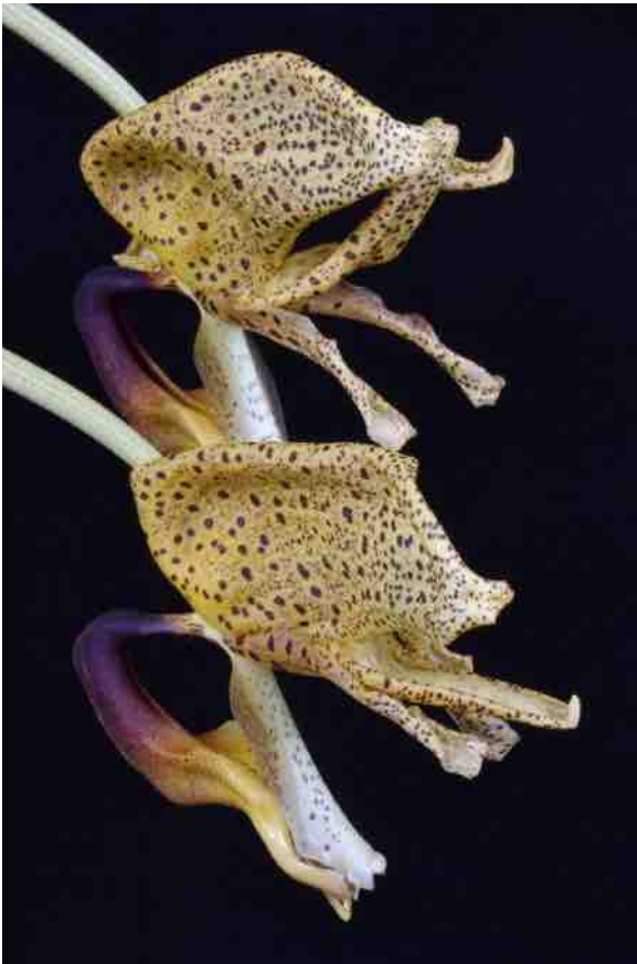
Left: Coryhopea Imagination 'Shogun's Spotted Dragon' AM/AOS, CCE/AOS, grown by Shogun Hawaii