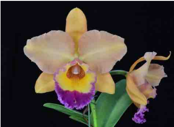
Left: Rlc. Princess of Hawaii 'Seductive' AM/AOS, grown by Shogun Hawaii