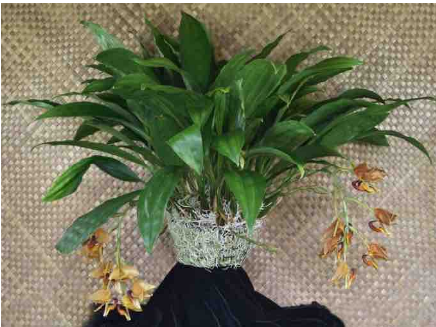
Left: Coryhopea Imaginations 'Shogun's Orange Leopard' AM/AOS grown by Shogun Hawaii