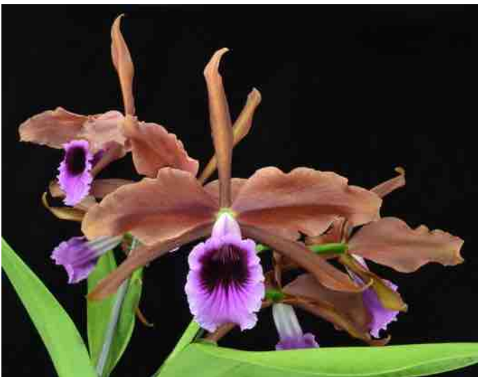
Left: Cattleya tenebrosa 'Good Grief Charlie Brown' AM/AOS, grown by Orchid Eros