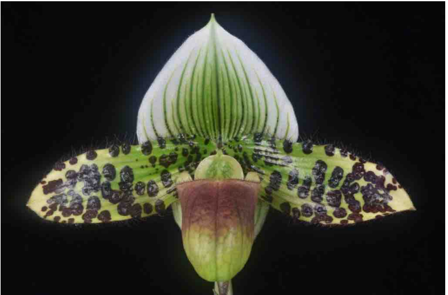
Paph. Mooning Wood 'Slipper Zone Spot Magnificence' AM/AOS grown by Lehua Orchids