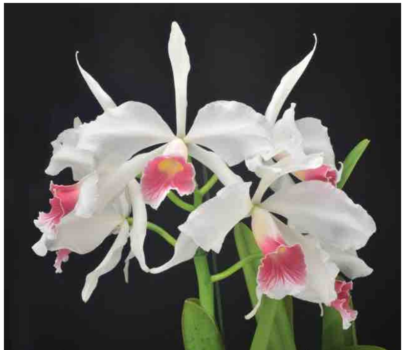
Right: Cattleya purpurata h.f. carnea 'Sebastian Ferrell' AM/AOS, grown by Orchid Eros