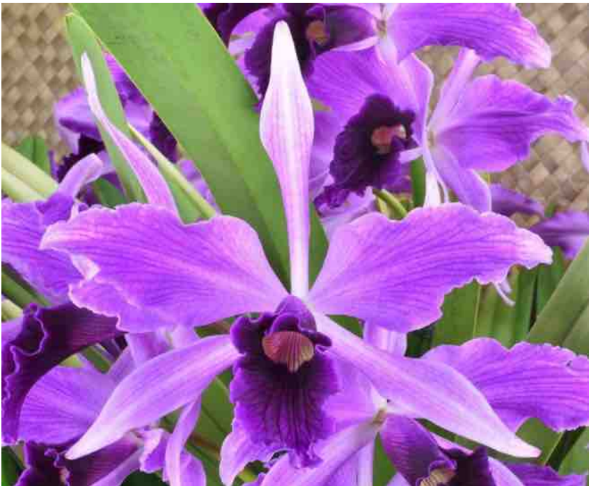
Left: Cattleya purpurata h.f. flava 'Shogun's Big Bang' HCC/AOS, grown by Shogun Hawaii