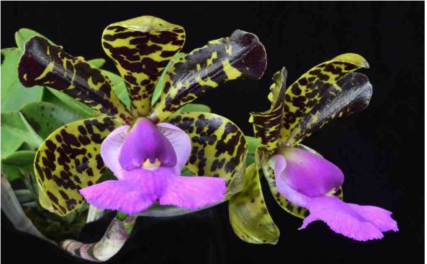
Cattleya aclandiae 'Urania' AM/AOS, grown by Orchid Eros