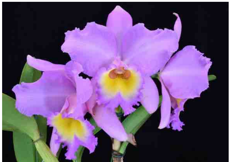
Right: Rlc. Princess of Hawaii 'Shogun's Pink Diamond' AM/AOS, grown by Shogun Hawaii