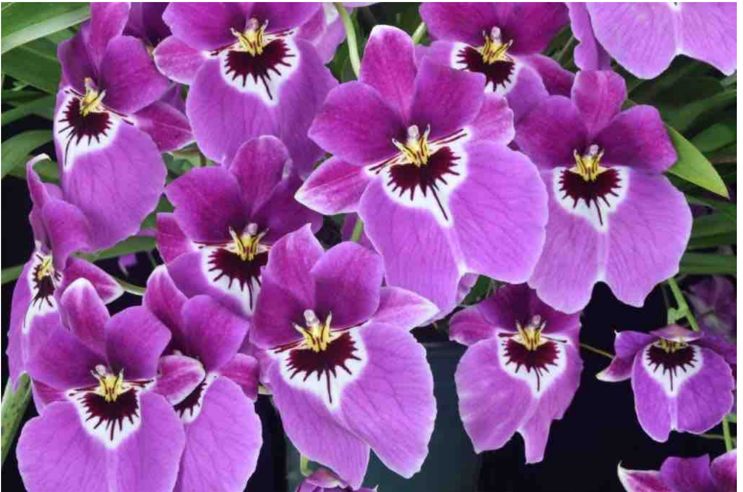
Miltoniopsis Prelapsarian 'Okika' AM/AOS, grown by Okika