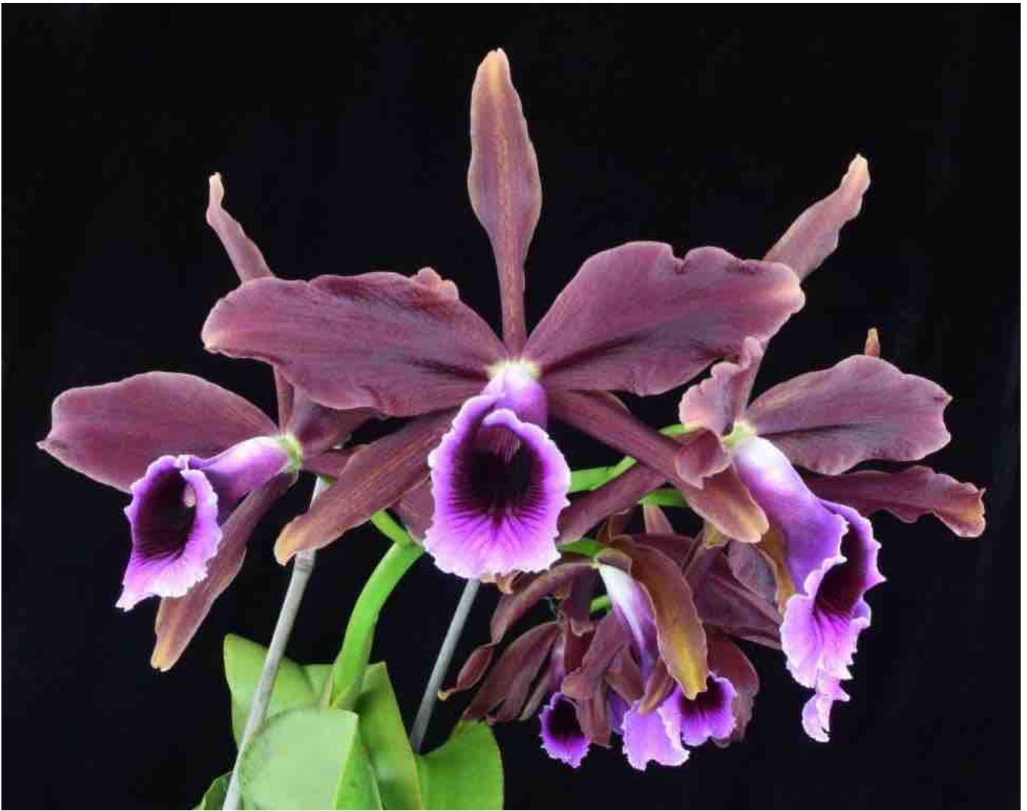
Cattleya tenebrosa 'Isabel Rosalia' FCC/AOS, grown by Orchid Eros