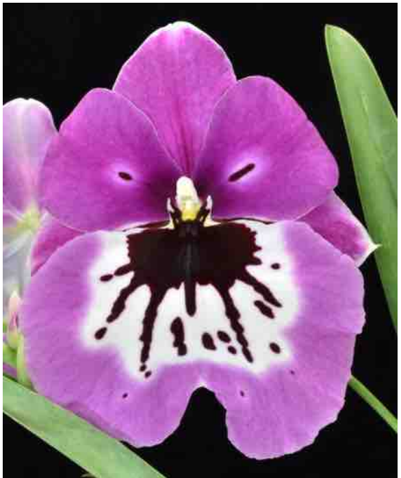
Right: Miltoniopsis Rubesque 'Brennan The Great' AM/AOS, grown by Okika