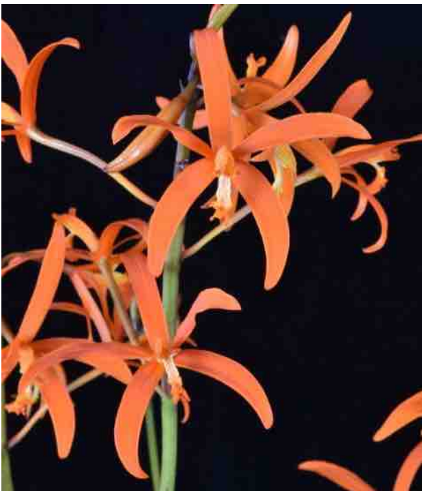
Left: Cattleya cinnabarina 'OrchidFix Thanks Ben' CCM/AOS grown by Orchid Fix