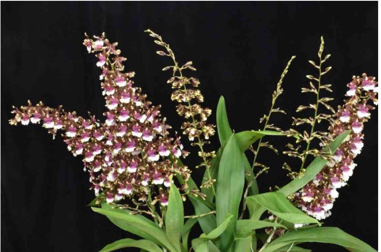
Oncidium 21st Scentury 'Hula Girl' AM/AOS, grown by Hilo Orchid Farm