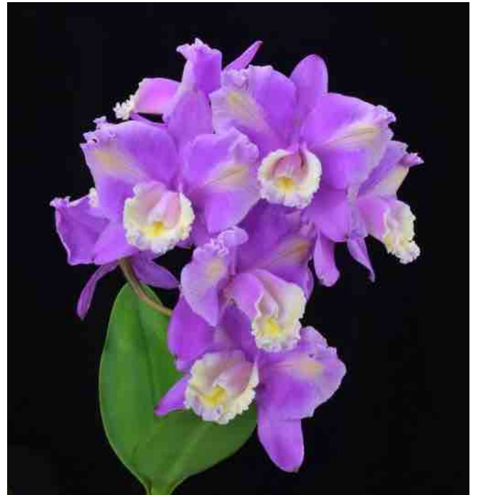
Left: Cattleya dowiana var. aurea 'Sebastian Ferrell' AM/AOS, grown by Orchid Eros Right: Cattleya harisoniana v. trilabelo 'Isabel Rosalia' AM/AOS, grown by Orchid Eros