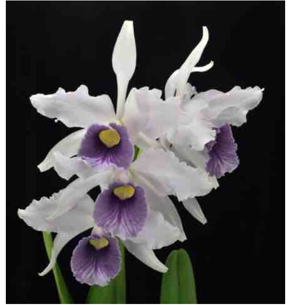
Left: Cattleya purpurata 'Blushing Bride' AM/AOS, grown by Orchid Eros Right: Cattleya purpurata h.f. werkhauzeri-striata 'Stevie Ray Vaughn' FCC/AOS, grown by Orchid Eros