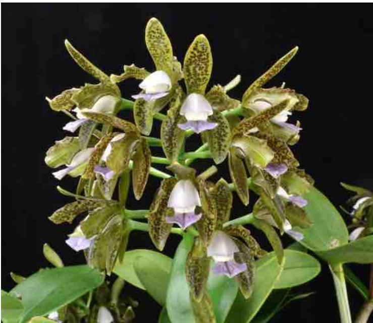
Left: Cattleya tigrina h.f. coerulea 'Catt Nutts' AM/AOS, grown by Orchid Eros