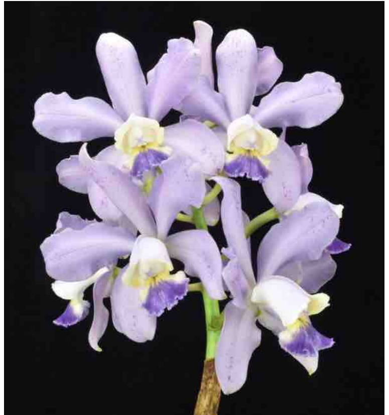
Left: Cattleya dowiana v. aurea 'Gabriel Amaru' FCC/AOS, grown by Orchid Eros Right: Cattleya Gaudii 'Blue Baby' AM/AOS, grown by Hilo Orchid Farm