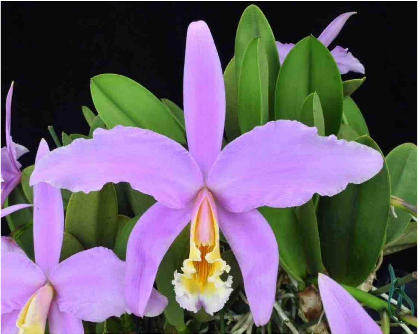
Cattleya jongheana 'Peppa Pig' AM/AOS, grown by Orchid Eros