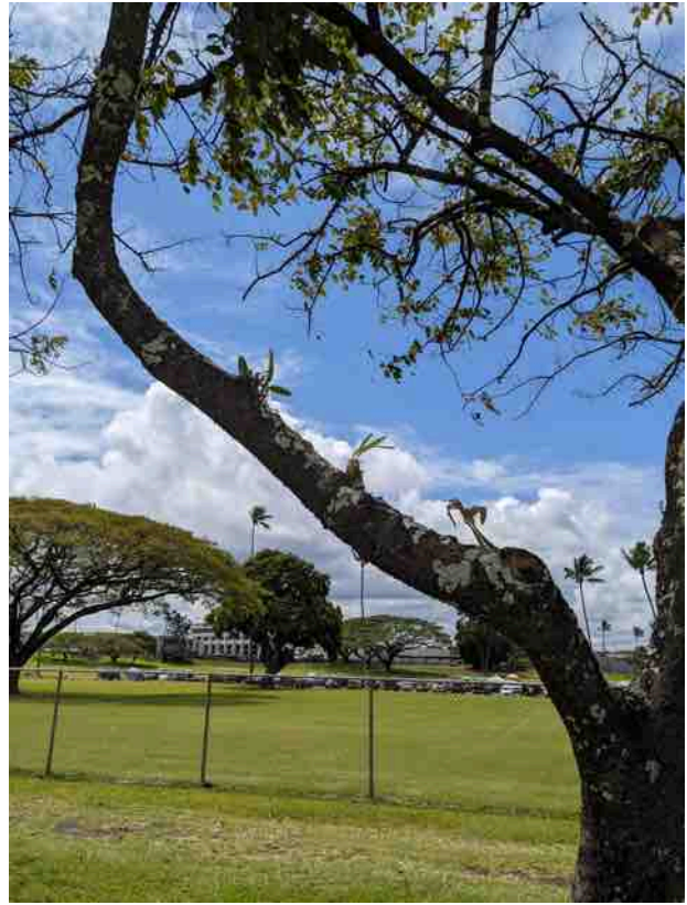
Orchids mounted on bayfront trees