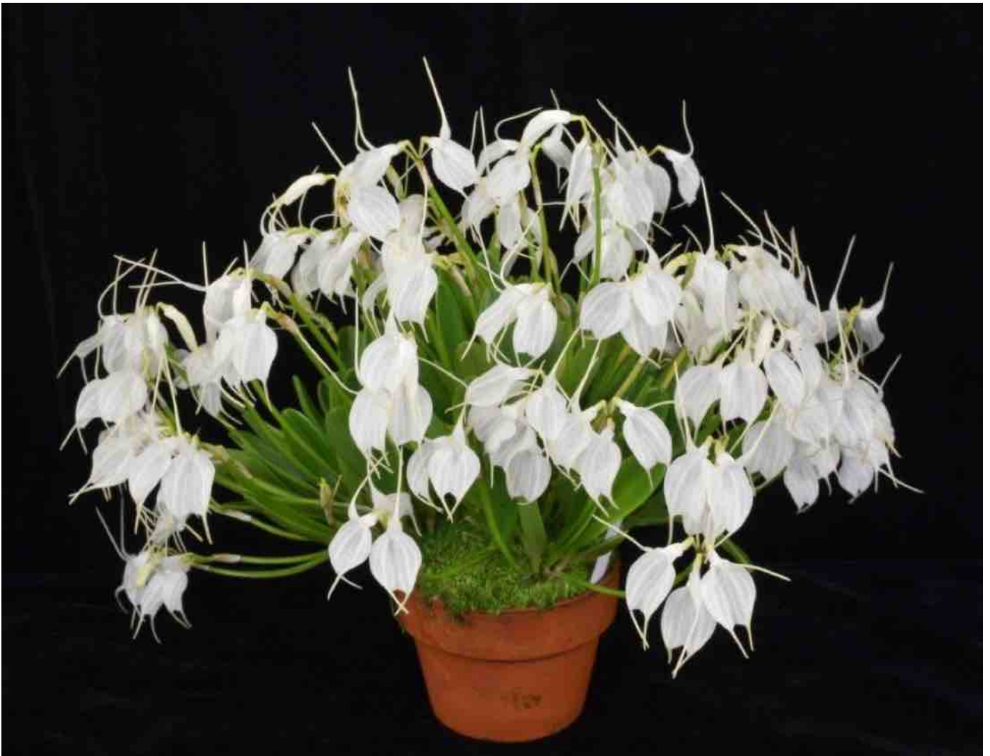
Masdevallia towarensis 'Princess Leia' CCE/AOS, grown by Jungle Mist Orchids