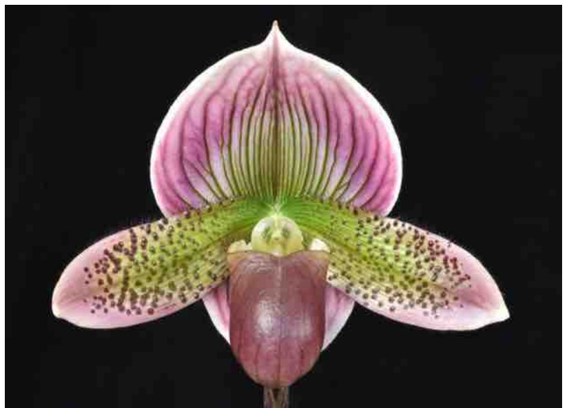
Right: Paphiopedilum Petula's Style 'Slipper Zone One Sixth' AM/AOS, grown by Lehua Orchids