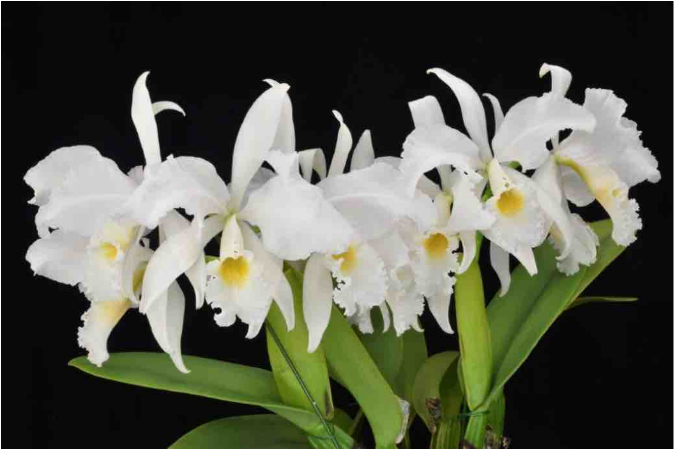
Cattleya warneri h.v. alba 'Mauna Kea' HCC/AOS, grown by Orchid Eros