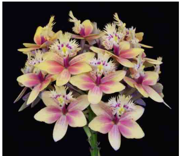
Right: Epidendrum (Wedding Valley x (Pacific Peacock x Pacific Kiwi)) 'Hilo Sunrise' AM/AOS, grown by OrchidFix