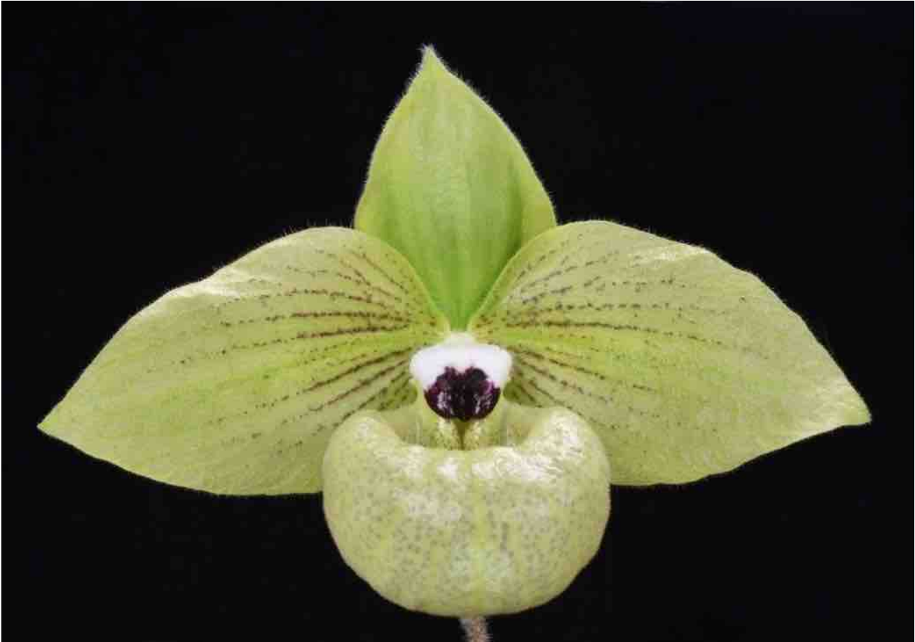
Paphiopedilum malipoense 'OrchidFix Mothera' AM/AOS, grown by OrchidFix