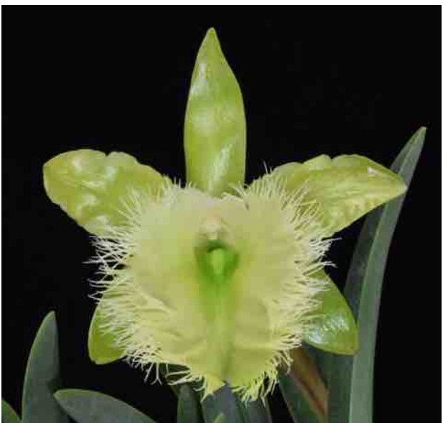
Left: Cattleya amethystoglossa h.f. flammea '50th' AM/AOS, grown by Orchid Eros