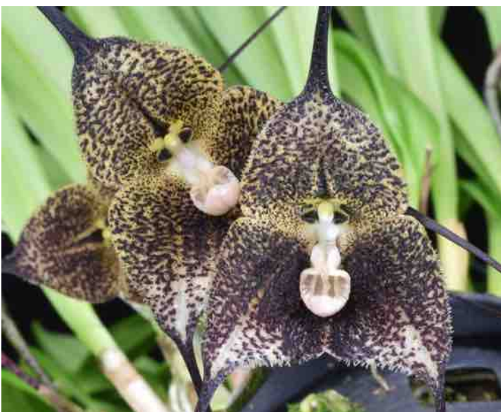
Left: Dracula barrowii 'Rancor's Pet' AM/AOS, grown by Jungle Mist Orchids