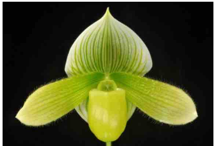
Left: Paph. Odette's Moon 'Slipper Zone Fullness' HCC/AOS, grown by Lehua Orchids Right: Paph. Spring Egret 'Slipper Zone Another' HCC/AOS, grown by Lehua Orchids