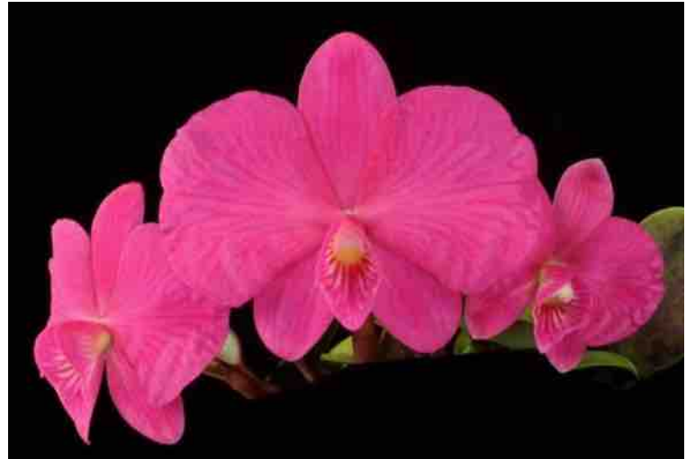
Left: Cattleya percivaliana f. coerulea 'Stevie Ray Vaughn' AM/AOS, grown by Orchid Eros Right: Cattleya wittigiana 'Mac Daddy' AM/AOS, grown by Orchid Eros