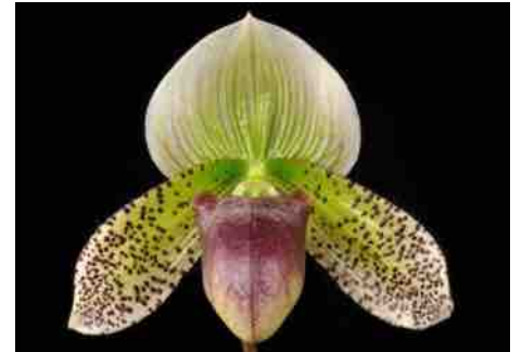
Left: Paph. Delightfully Macabre 'Slipper Zone Desire' HCC/AOS, grown by Lehua Orchids Center: Paph. Jeweled Moon 'Slipper Zone Joyfully' HCC/AOS, grown by Lehua Orchids Right: Paph. Mystically Fred 'Slipper Zone Gracefulness' AM/AOS, grown by Lehua Orchids