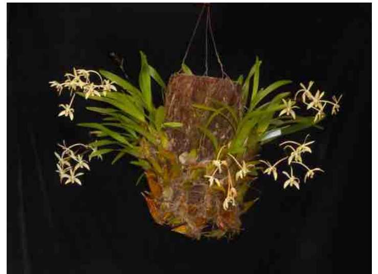
Right: Hobbyist 3 rd place: Epigeneium cymbidioides , grown by Thane Pratt