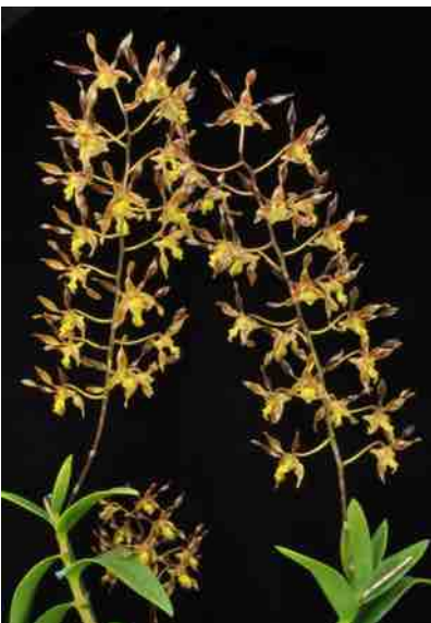
Below left and right: Dendrobium (mirbelianum x johannis) 'Chocolate Cream Twist' AM/AOS, grown by Island Sun Orchids