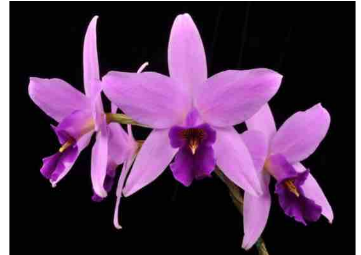
Left: Cattleya wittigiana 'Sebastian' HCC/AOS, grown by Orchid Eros