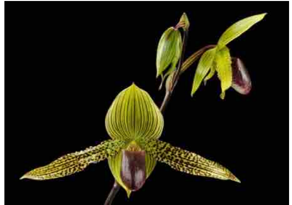
Right middle: Paph. Iantha Stage 'Triple Gem Lehua' AM/AOS, grown by Lehua Orchids