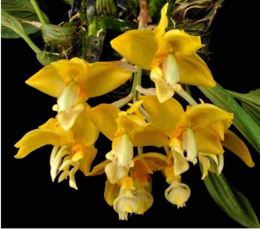
Above: Stanhopea graveolens "The OrchidWorks" AM/AOS, grown by The OrchidWorks.