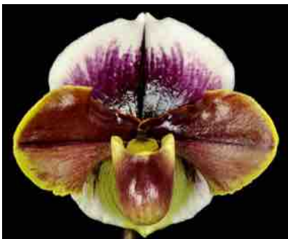
Below right: Paph. Hawaiian Illusion 'Wowie Lehua' HCC/AOS, grown by Lehua Orchids