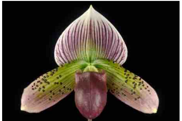
Below left: Paph Willow Crest 'Holiday Season' HCC/AOS, grown by Hilo Orchid Farm