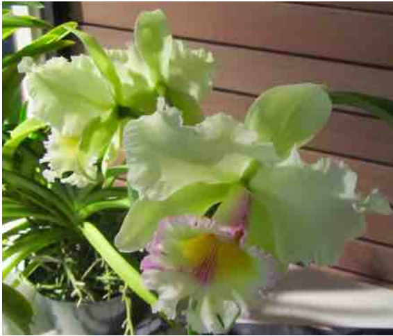
Commercial 1 st place: Blc. (Volcano Classic x Akaksuka Fiftieth Anniversary), grown by Akatsuka Orchid Gardens