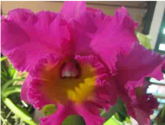
Commercial 2 nd place: Blc. (Volcano Classic x Akaksuka Fiftieth Anniversary), grown by Akatsuka Orchid Gardens