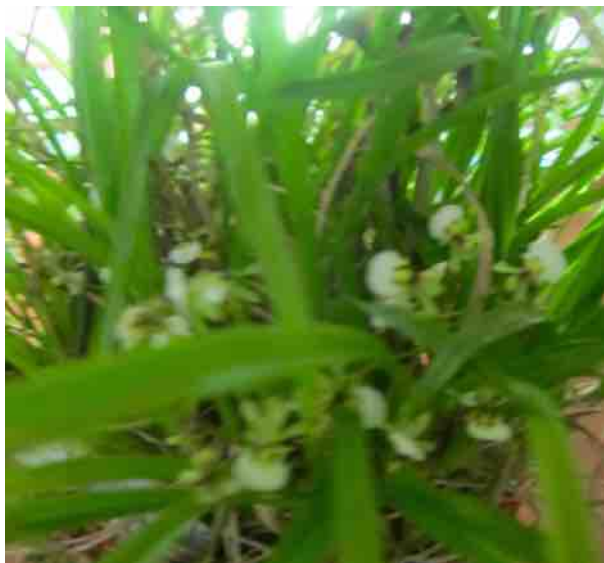
Left: Hobbyist 1 st place: Ornithophora radicans , grown by Josh Black