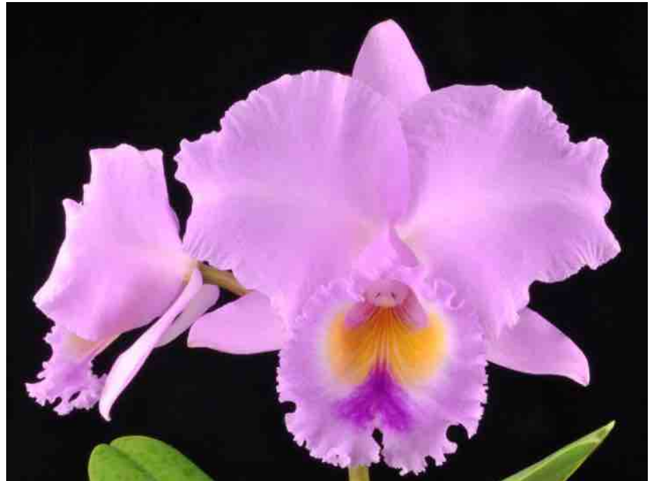
Left: Oncostele Hilo Firecracker AM/AOS, exhibited by Hilo Orchid Farm Right: Cattleya trianae 'Full Moon' HCC/AOS, exhibited by Orchid Eros