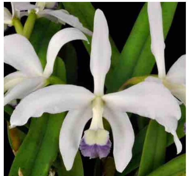
Left: Paphiopedilum Dollgoldi 'Claedr' AM/AOS, exhibited by The Orchid Fix Right: Cattleya perrinii v. coerulea 'Sebastian' HCC/AOS, exhibited by Orchid Eros