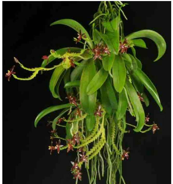
Right: Phalaenopsis cornu-cervi f. chattaladae 'Uncle Elgie' CCM/AOS, exhibited by OrchidWorks