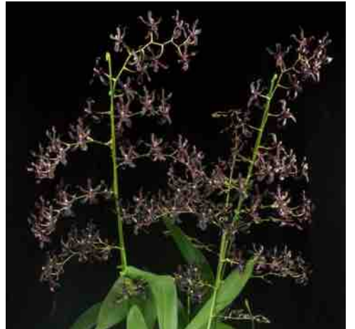
Left: Dracula woolwardiae 'Jungle Mist' AM/AOS, exhibited by Jungle Mist Orchids Center: Laelia ghillanyi 'Butter Cream' AM/AOS, exhibited by Orchid Eros Right: Cyrtocidium Midnight 'Dantesque' JC/AOS, exhibited by Mauna Kea Orchids