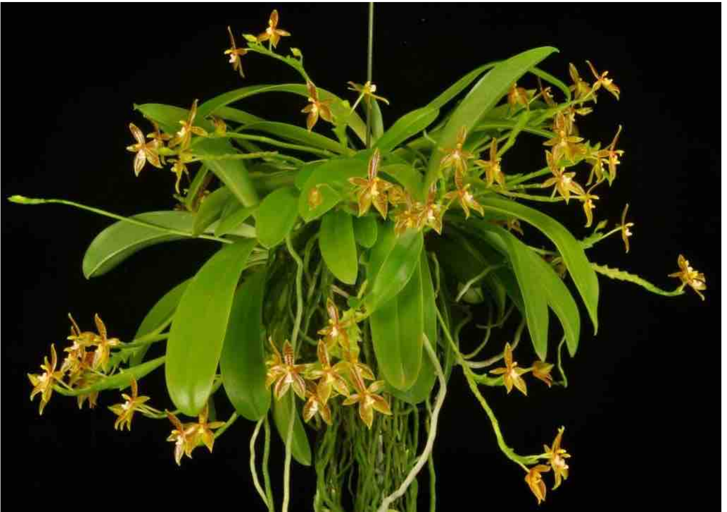
Phalaenopsis cornu-cervi 'Eugene' CCM/AOS, exhibited by OrchidWorks