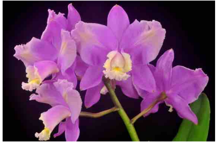
Left: ( Slc. Firelighter x Cattleya walkeriana ) 'Orchid Eros' AM/AOS, exhibited by Orchid Eros Right: Cattleya harrisoniana 'Next Generation Splash' AM/AOS, exhibited by Orchid Eros