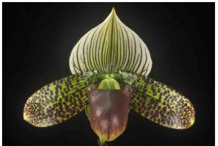
Left: Dendrobium unicum 'Tangerine Feast' AM/AOS, exhibited by Hilo Orchid Farm Right: Paphiopedilum Captivatingly Wood 'Lehua's Sneakiness 99' HCC/AOS, exhibited by Lehua Orchids