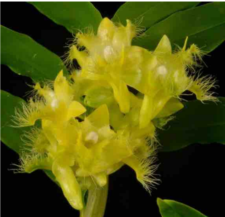
Left: Dendrobium roslii (syn. terengganuensis ) 'Hairy Canary' CHM/AOS, exhibited by Hilo Orchid Farm