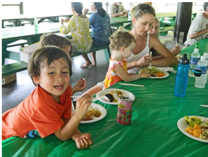
A good time was had by all.