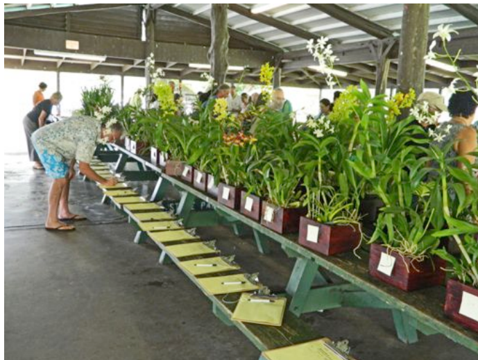
Donated plants were auctioned, including the handsome boxes.