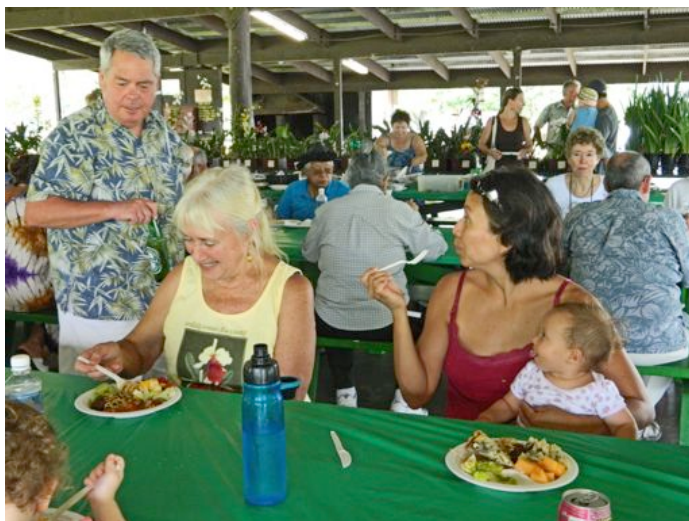
No program, just enjoying ourselves with friends.