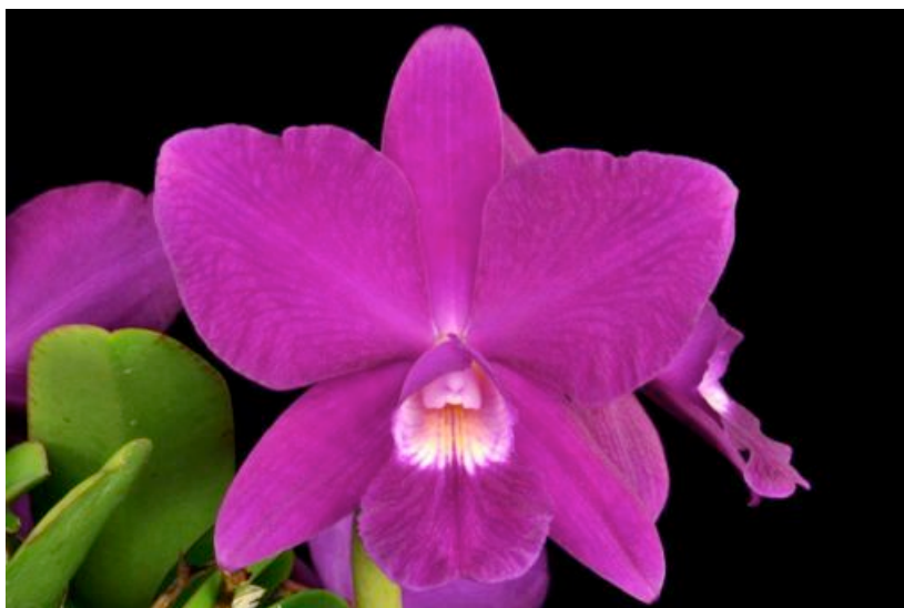
Slc. Miyuki Little King 'Dark Star' AM/AOS, exhibited by Orchid Eros