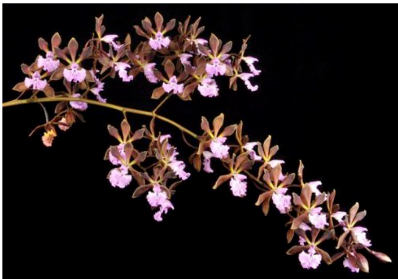
Encyclia phoenicea 'Orchid Eros' HCC/AOS, exhibited by Orchid Eros