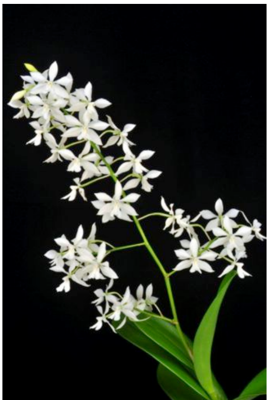
Epiarthron Kevin Mark Ragbir 'Snow White' HCC/AOS, exhibited by Orchid Eros