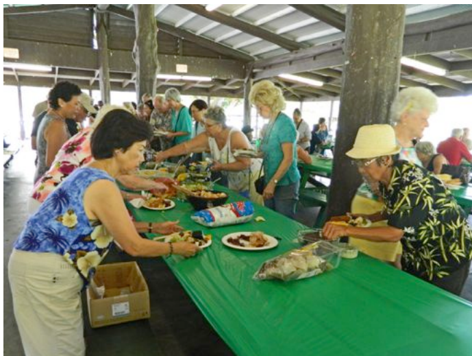
We loaded up on the delicious food that members brought.

Last month's meeting was a picnic in Wailoa River Park, with a silent auction of plants donated by orchid show vendors. If you didn't make the meeting, you missed a good time!