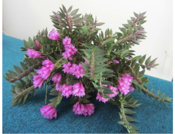
Left: Commercial 1 st place – Paph. Delrosi ‘Wings’ x Mount Toro ‘Purity’, grown by Lehua Orchids Right: Commercial 2 nd place – Dendrobium dichaeoides, grown by Seven Rocks Orchids