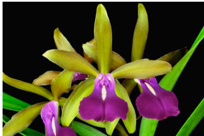
Bc. Oliveros ‘Jack’ HCC/AOS, exhibited by Orchid Eros