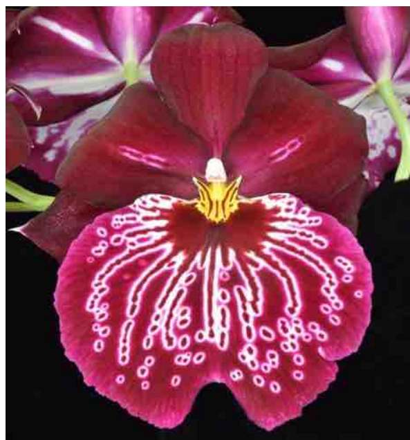
Right: Miltoniopsis Gignoskein 'Light Dancer' AM/AOS, grown by Okika