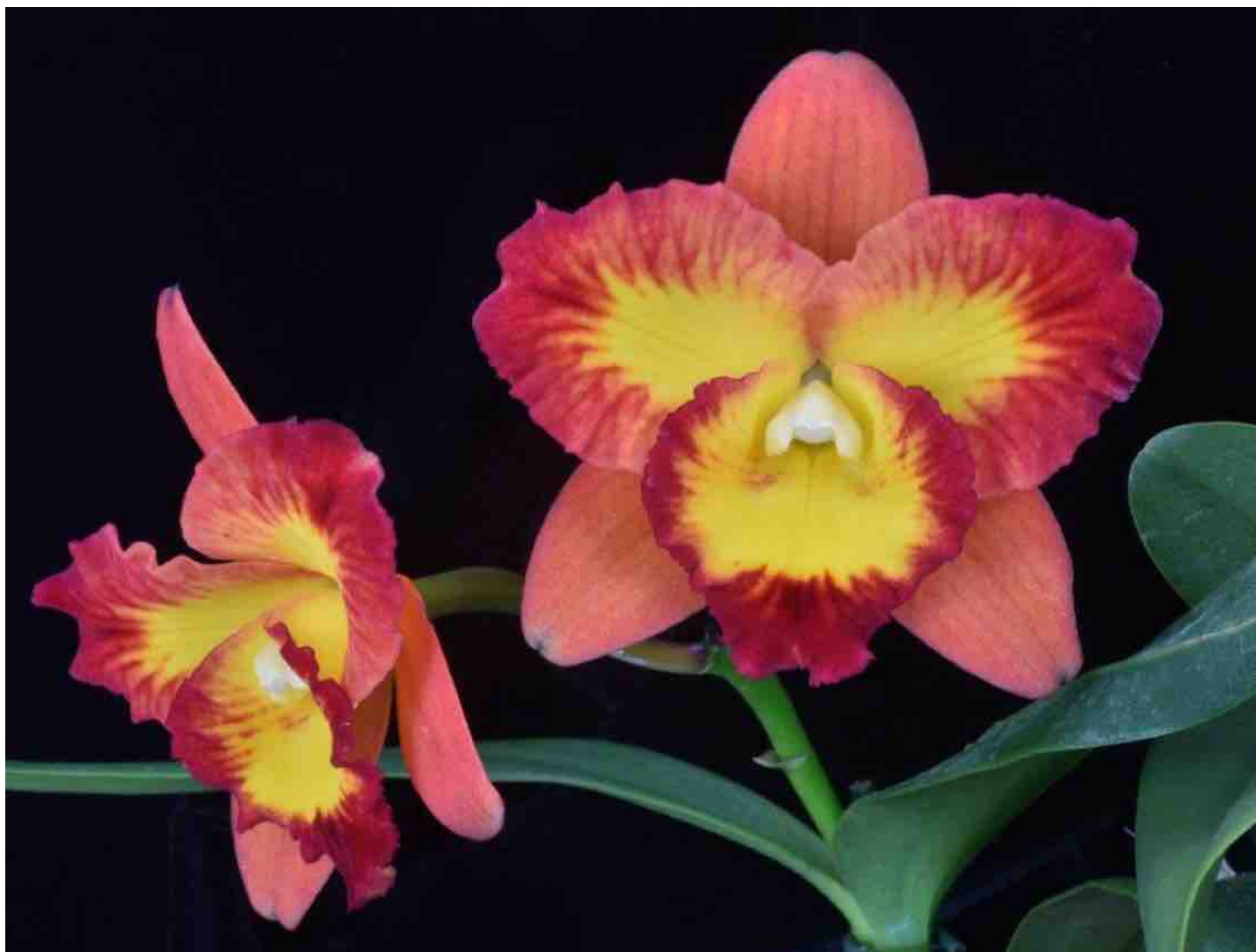
Cattleya Bella del Caribe 'Matty' AM/AOS, grown by Island Sun Orchids