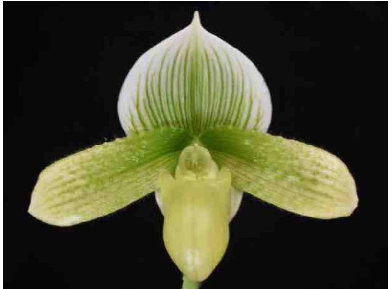
Left: Oncostele Tan Treasures 'Puppy Pleasures' AM/AOS, grown by Okika Right: Paph. Alpine Pleasure 'Yellow Tag Wins' AM/AOS, grown by Lehua Orchids