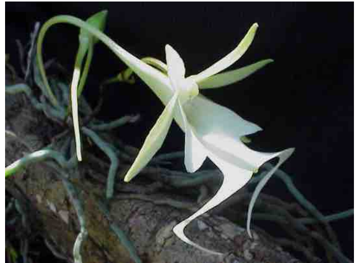
The Ghost Orchid, Dendrophylax lindenii

If you'd like to hear about our Orchid Isle Project and find out more about the fascinating Ghost Orchid, don't miss this meeting!