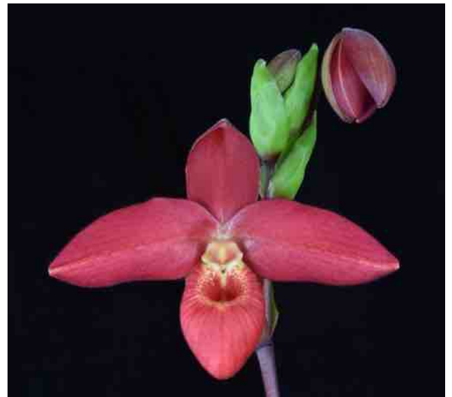
Left: Paph. Odette's Adoration 'Slipper Zone Over 300' HCC/AOS, grown by Lehua Orchids Right: Phrag. Jason Fischer 'OrchidFix Happy Christmas' AM/AOS, grown by OrchidFix.