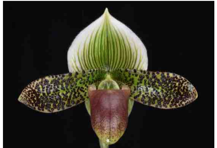
Left: Paph. Apapa 'Jet Jet' AM/AOS, grown by Hilo Orchid Farm Right: Paph. Lune Francais 'Slipper Zone That's All Folks' HCC/AOS, grown by Lehua Orchids