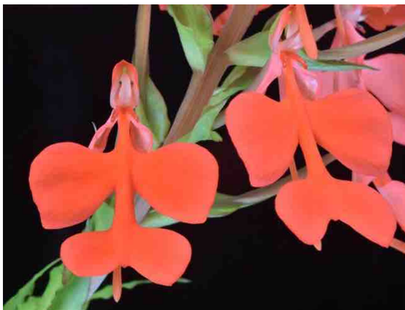
Left: Habenaria rhodochila ssp. rhodochila 'Big Bad Boy' AM/AAOS, grown by Island Sun Orchids