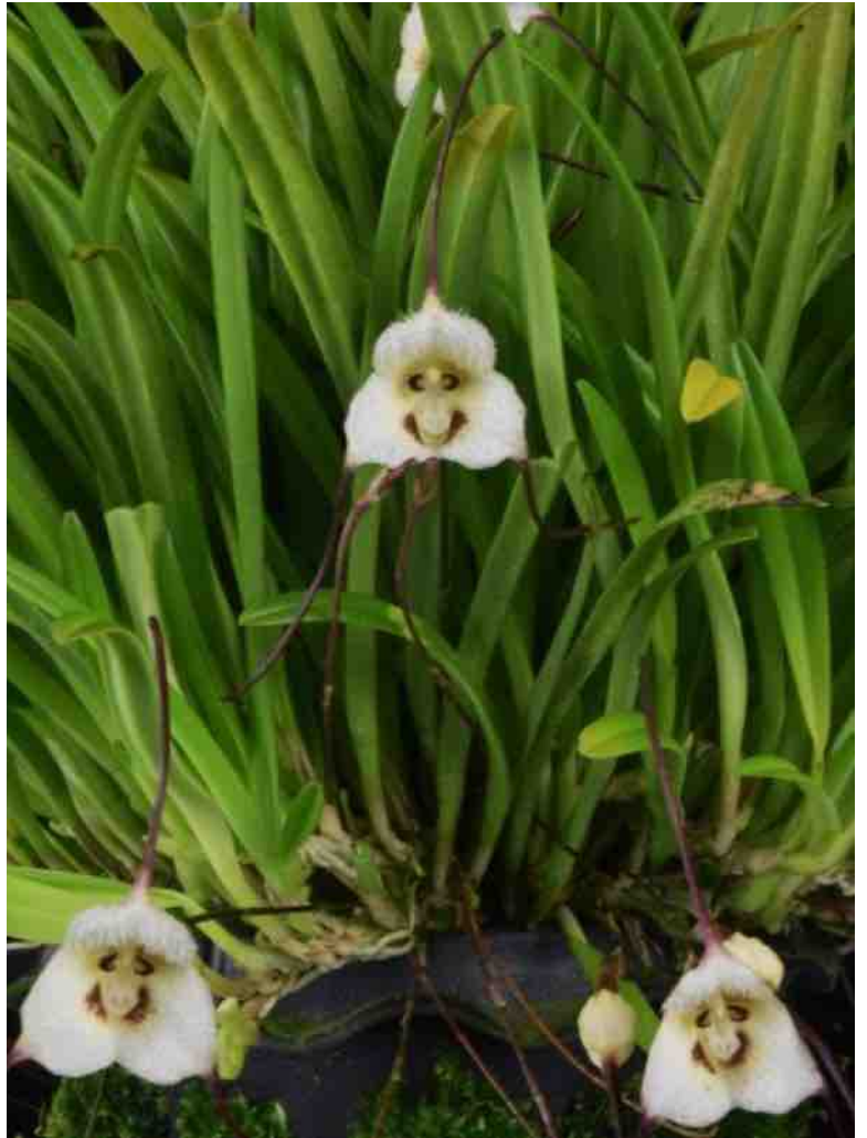
Left: Aeridovanda Long and Lavish 'Spot' HCC/AOS, grown by Aka' s Orchids Right: Dracula lotax 'Dean's One' AM/AOS, grown by Jungle Mist Orchids