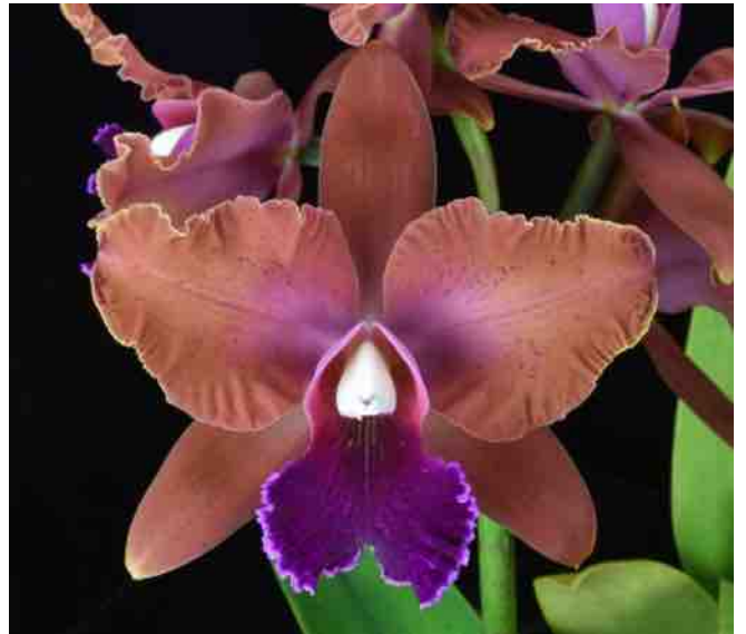
Left: Rlc. Golden Godzilla 'Shogun's Golden Beast' AM/AOS, grown by Shogun Hawaii Right: Rlc. Lestat 'Interview with a Vampire' AM/AOS, grown by Orchid Eros