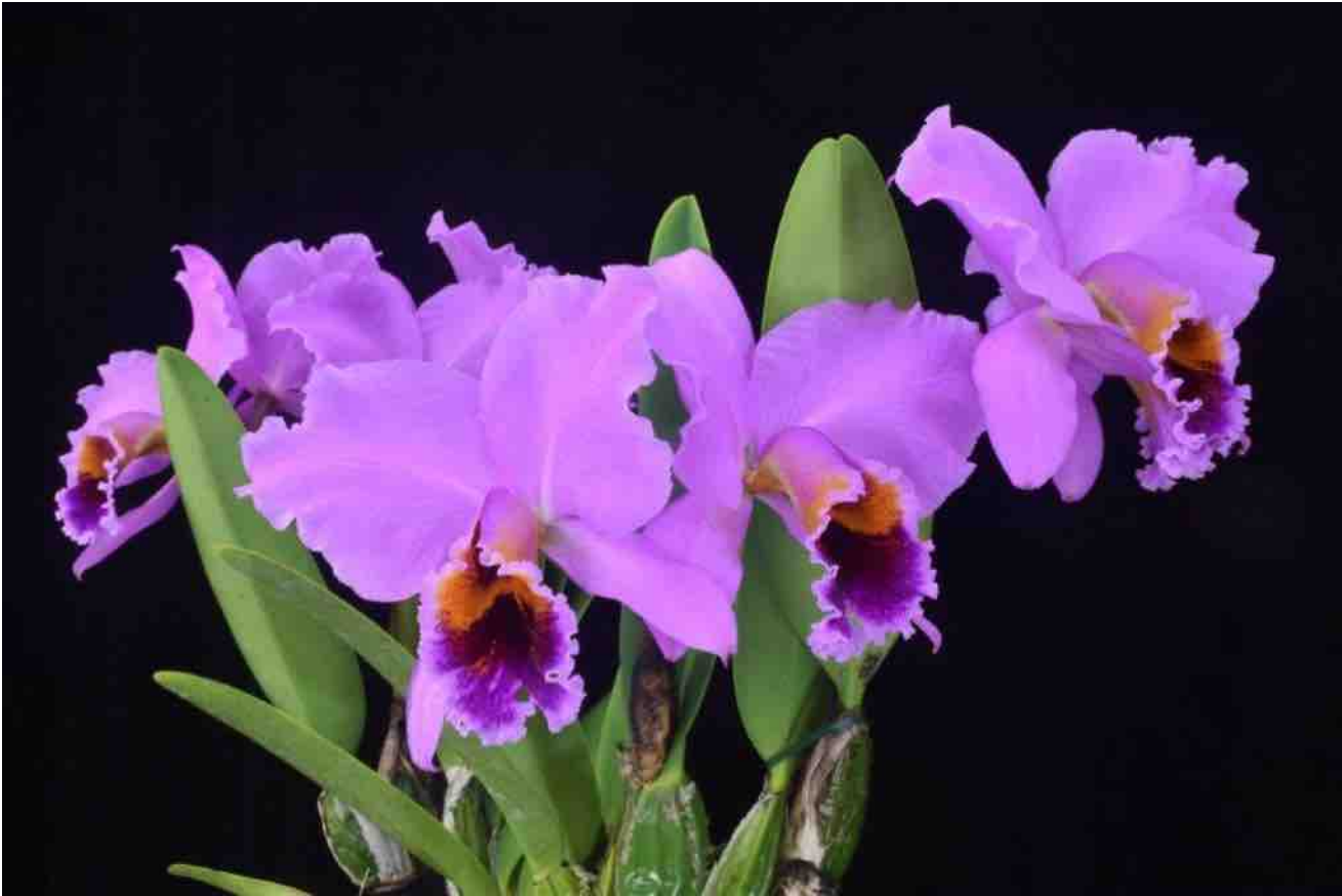
Cattleya percivaliana 'Dave Off' FCC/AOS, grown by Orchid Eros.