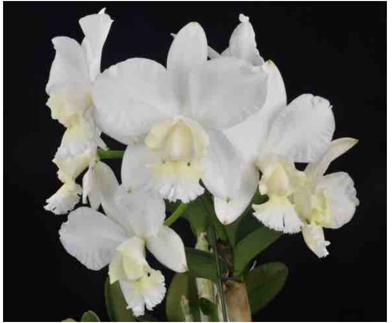
Left: Brassocattleya Hamlyn's Magic 'Rowan's Return' AM/AOS, grown by Orchid Eros Right: Cattleya x dolosa v. alba 'Gabe-O' AM/AOS, grown by Orchid Eros