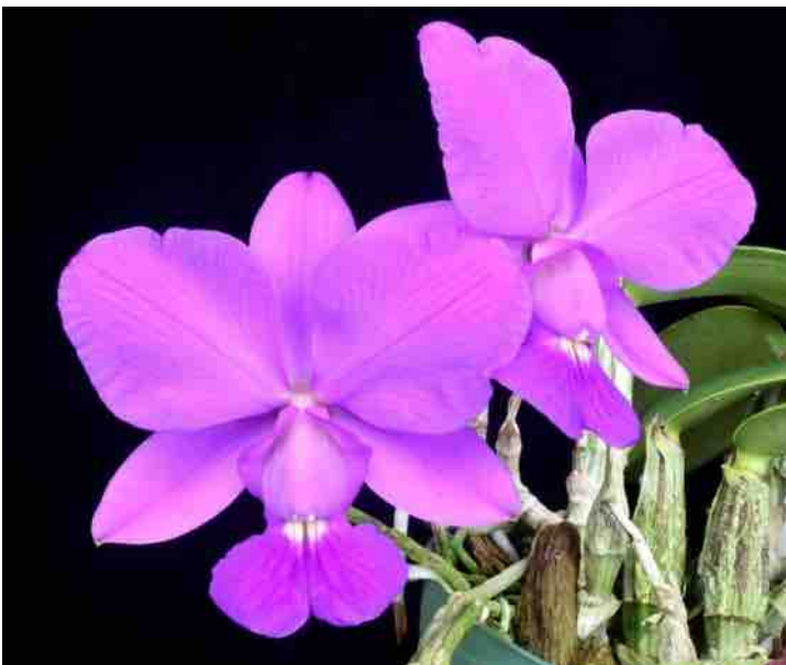
Below right: Cattleya walkeriana 'Polyhymnia' AM/AOS. Grown by Orchid Eros