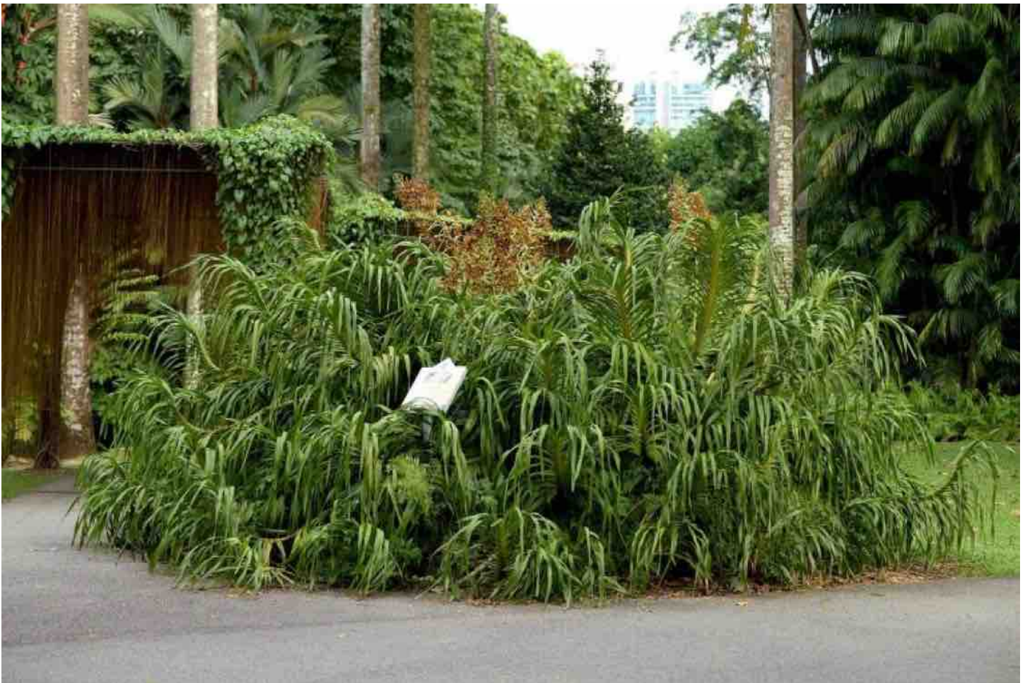
Tiger orchid ( Grammatophyllum speciosum ) in the Singapore Botanic Gardens.