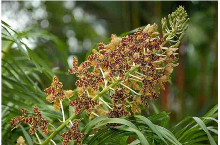
Closeup of flowers