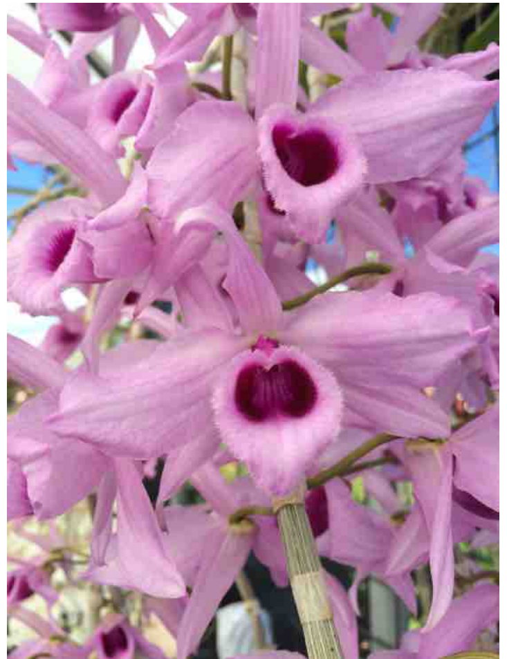
Honohono ( Dendrobium anosmum ), grown by Bill Rawson.