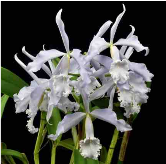
Above left: Cattleya amethystoglossa 'Put Me in the Zoo' AM/AOS, grown by Orchid Eros