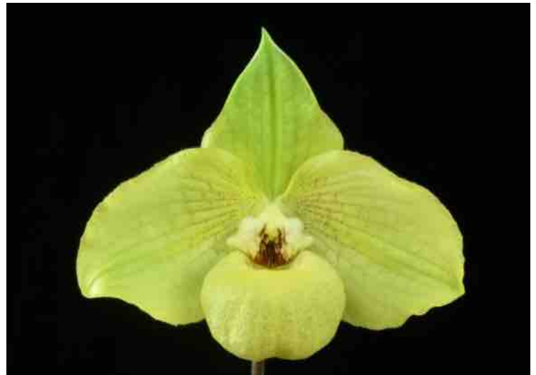
Left: Paph. (Rick Berry x In Charm Lovely) 'Pumpkin Crunch' AM/AOS, grown by Hilo Orchid Farm