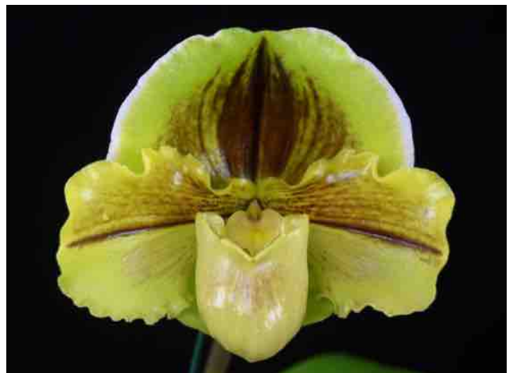
Left: Paph. Hilo Shamrock 'Green Diamond' AM/AOS, grown by Hilo Orchid Farm