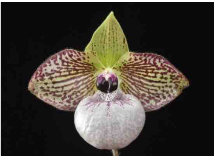
Paph. Wilbur Chang 'Legendary' HCC/AOS, grown by Hilo Orchid Farm