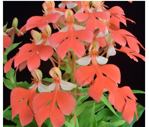
Left: Paph. In Charm Topaz 'Slipper Zone No Cuts' AM/AOS CCM/AOS, grown by Lehua Orchids Center: Paph. micranthum var. eburneum 'Mars' AM/AOS, grown by Hilo Orchid Farm Right: Habenaria rhodocheila 'Island Sun' AM/AOS, grown by Island Sun Orchids