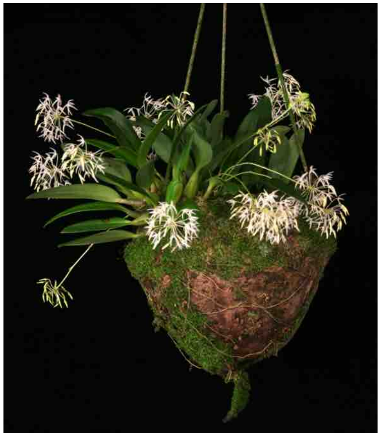
Right: 3 rd place: Bulbophyllum laxiflorum , grown by Jeff Fendentz