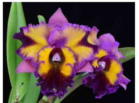
Left: Cattleya (Spring Climax x Nancy Off) 'Shogun Hawaii' HCC/AOS, grown by Shogun Hawaii Center: Paph. Petula's Charisma 'Slipper Zone Flay Ambiance' HCC/AOS, grown by Lehua Orchids Right: Rlc. Island Warrior 'Blood Sweat and Tears' HCC/AOS, grown by Shogun Hawaii