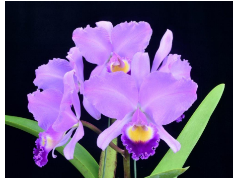
Left: Brassavola nodosa 'Dia de los Muertos' AM/AOS, grown by Orchid Eros Center: Cattleya Harriet Brickell 'Happy Halloween' AM/AOS, grown by Orchid Eros Right: Cattleya trianae 'For the Living' AM/AOS, grown by Orchid Eros