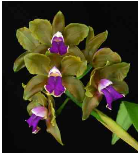
Left: Cattleya bicolor 'Sebastian Ferrell' AM/AOS, grown by Orchid Eros Center: Cattleya bicolor 'Sense and Color' AM/AOS, grown by Orchid Eros Right: Cattleya bicolor 'Teccapin Station' AM/AOS, grown by Orchid Eros