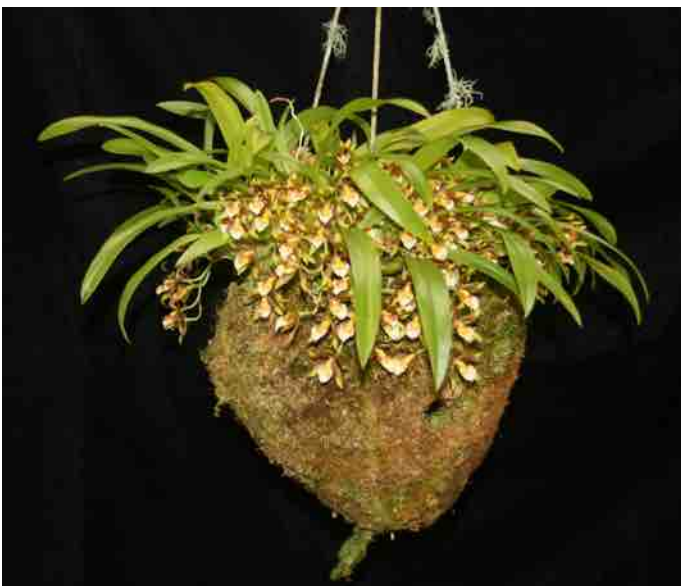
Left: 2 nd place: Cischweinfia pusila , grown by Jeff Fendentz