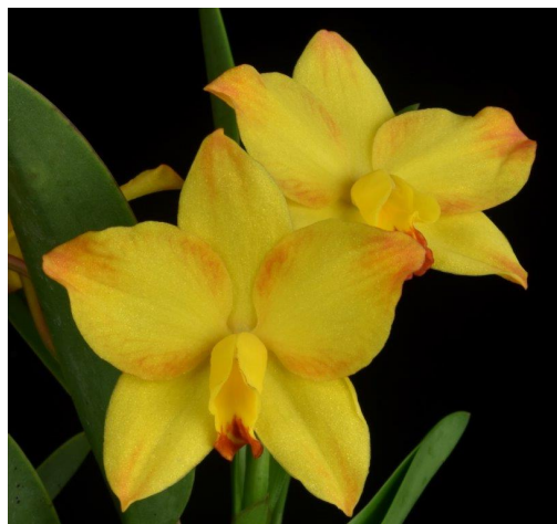
Left: Cynoches cooperi 'Isabel Rosalia' CCM/AOS, grown by Orchid Eros Center: Rlc. Harriet Brickell 'St. Augustine' AM/AOS, grown by Orchid Eros Right: Cattleya Pole Star 'Gabriel' AM/AOS, grown by Orchid Eros