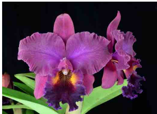
Left: Rlc. Pamela Ann Oliveros 'Mom's Best' AM/AOS, grown by Shogun Hawaii Right: Rlc. Sydney Southwick 'Dark Devil' AM/AOS, grown by Shogun Hawaii