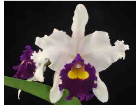
Left: Cattleya ghillanyi fma. flamea, awarded as Laelia reginae 'Isabel Rosalia' AM/AOS, grown by Orchid Eros Center: Paph. Odette's Moon 'Slipper Zone Pink Halo' HCC/AOS, grown by Lehua Orchids Right: Rlc. Volcano Glory 'Perfection' AM/AOS, grown by Shogun Hawaii