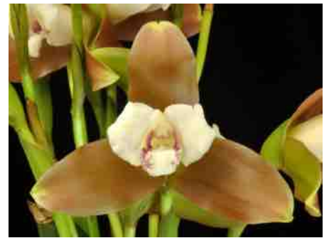
Left: Cattleya Mareeba Tiger 'Darth Sidius' AM/AOS, grown by Orchid Eros Center: Cattleya Mareeba Tiger 'Kylo Ren' AM/AOS, grown by Orchid Eros Right: Lycaste dowiana 'Lehua's Taylor Treat' HCC/AOS, grown by Lehua Orchids