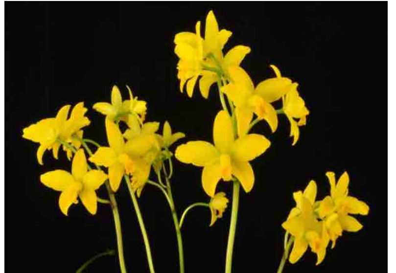
Left: Cattleya schilleriana 'Sebastian Ferrell' AM/AOS, grown by Orchid Eros Right: Laelia briegei 'Palila' AM/AOS, grown by Orchid Eros