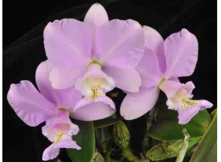
Left: Cattleya maxima v. alba 'Mem. Ellen Oliveros' AM/AOS, grown by Orchid Eros Center: Cattleya nobilior 'Orchid Eros' AM/AOS, grown by Orchid Eros