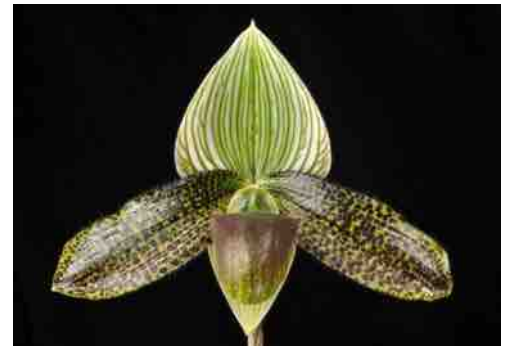
Left: Paph. Jacqueline's Spring Moon 'Slipper Zone Well I Never' AM/AOS, grown by Lehua Orchids Center: Paph. Luna Pleasure 'Slipper Zone Tall Grace' AM/AOS, grown by Lehua Orchids Right: Paph. Petula's Knight 'Slipper Zone reen Ninja HCC/AOS, grown by Lehua Orchids