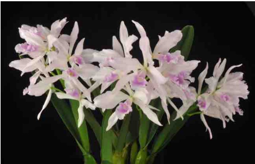
Cattleya purpurata fma. delicata 'Shogun's Grace' HCC/AOS, grown by Shogun Hawaii