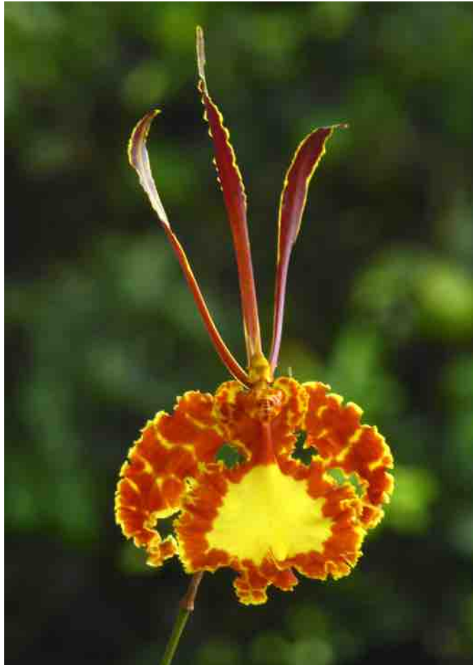
Psychopsis papilio.

It’s hard to find the species Psychopsis papilio for sale, but a hybrid of it called Psychopsis Mendenhall ‘Hildos’ FCC/AOS is commonly available. The hybrid looks almost identical to the species, which is not surprising because its ancestry is \frac{3}{4} Psychopsis papilio and \frac{1}{4} another related species. It likes warm conditions and does well here in Hawaii.