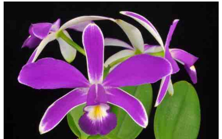
Left: Cattleya schilleriana 'Gabriel Amaru' AMAOS, grown by Orchid Eros Right: Cattleya violacea "Sebastian Ferrell" AM/AOS, grown by Orchid Eros