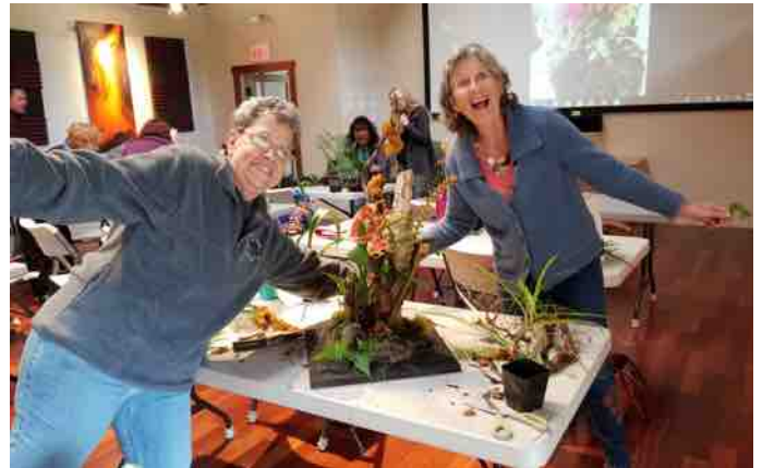
Participants at the last workshop show off their mini display in progress.

By popular demand, Donna Barr and Shelby Smith are holding another orchid workshop on how to create a mini orchid display. It will be held on Sat., May 26 2018 from 1:00 to 4:00 p.m. at the Kamana Senior Center, room AB. Participants will learn how to create a beautiful orchid mini display by creating one themselves using a few orchids plus other natural materials. Orchids and materials will be provided. Cost is $25. You can sign up at the HOS meeting.