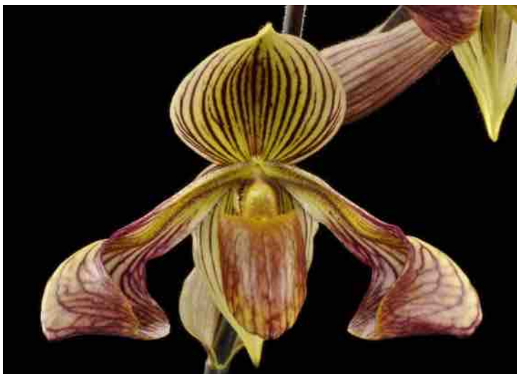
Right: Paph. Hsinying Anita 'Slipper Zone Tall and Dark' AM/AOS, grown by Lehua Orchids