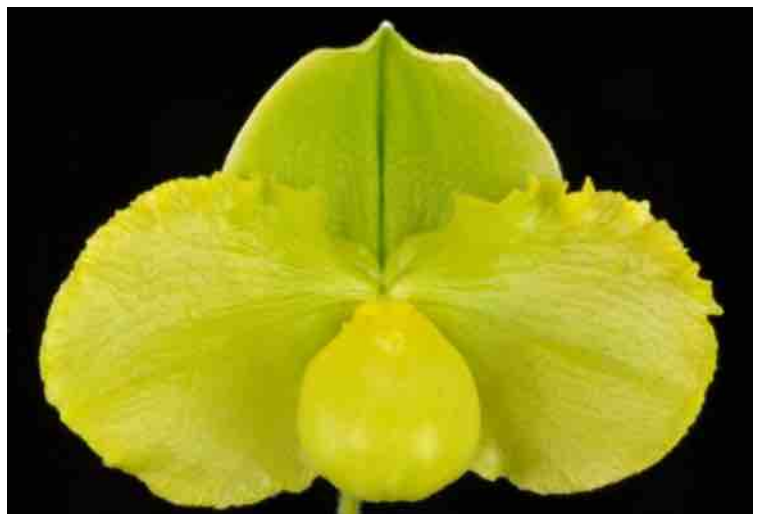
Left: Paph. Lippewunder 'John' HCC/AOS, grown by Hilo Orchid Farm