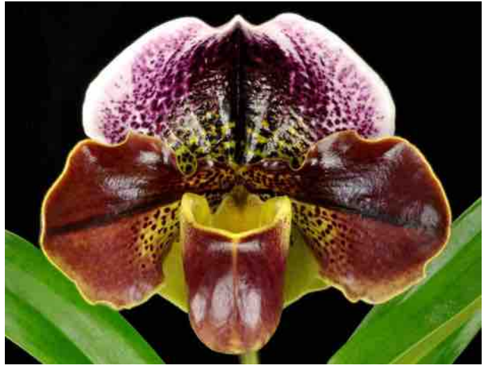
Left: Paph. Hawaiian Kapuna 'Slipper Zone Masterful' HCC/AOS, grown by Lehua Orchids