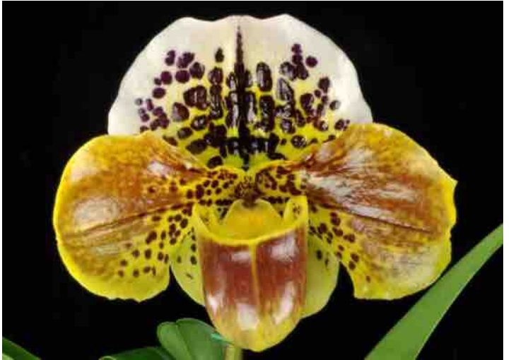
Left: Paph. Tuscan 'Crème Brulee' AM/AOS, grown by Hilo Orchid Farm