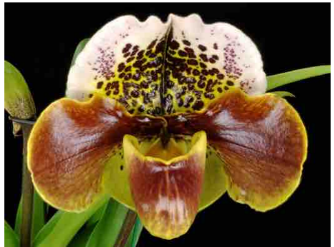
Left: Paph. Petula's Dandy 'Slipper Zone Dito' AM/AOS, grown by Lehua Orchids