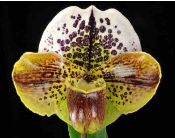
Right: Paph. Joan Viggiani 'Glossy Green' AM/AOS, grown by Hilo Orchid Farm