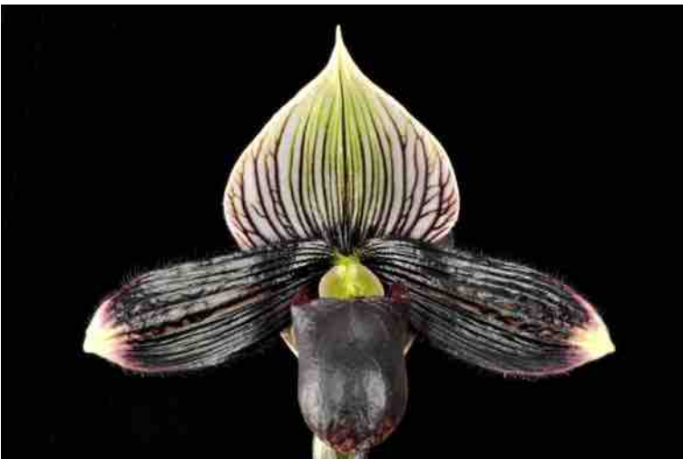
Right: Paph. Jaeger 'Jackpot' HCC/AOS, grown by Hilo Orchid Farm