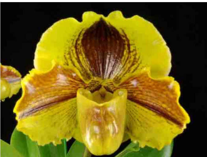
Right: Paph. Hilo Moon 'Grace' AM/AOS, grown by Hilo Orchid Farm