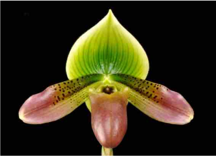
Right: Paph. Yellow Leopard 'Bold Spots' AM/AOS, grown by Hilo Orchid Farm